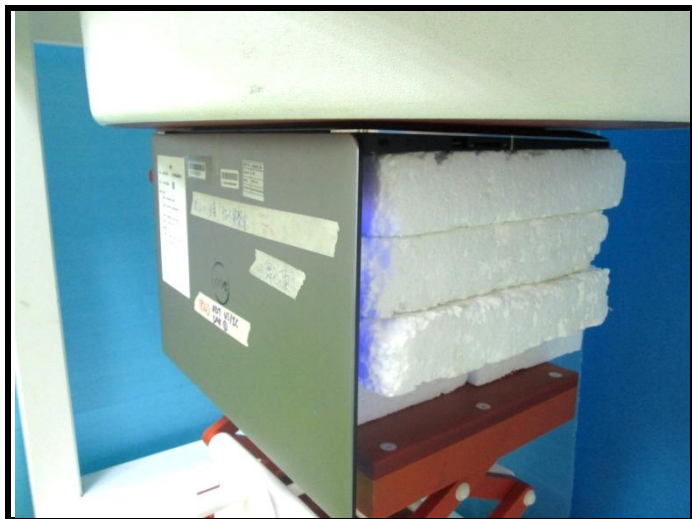
Bottom of EUT with 0 cm Gap