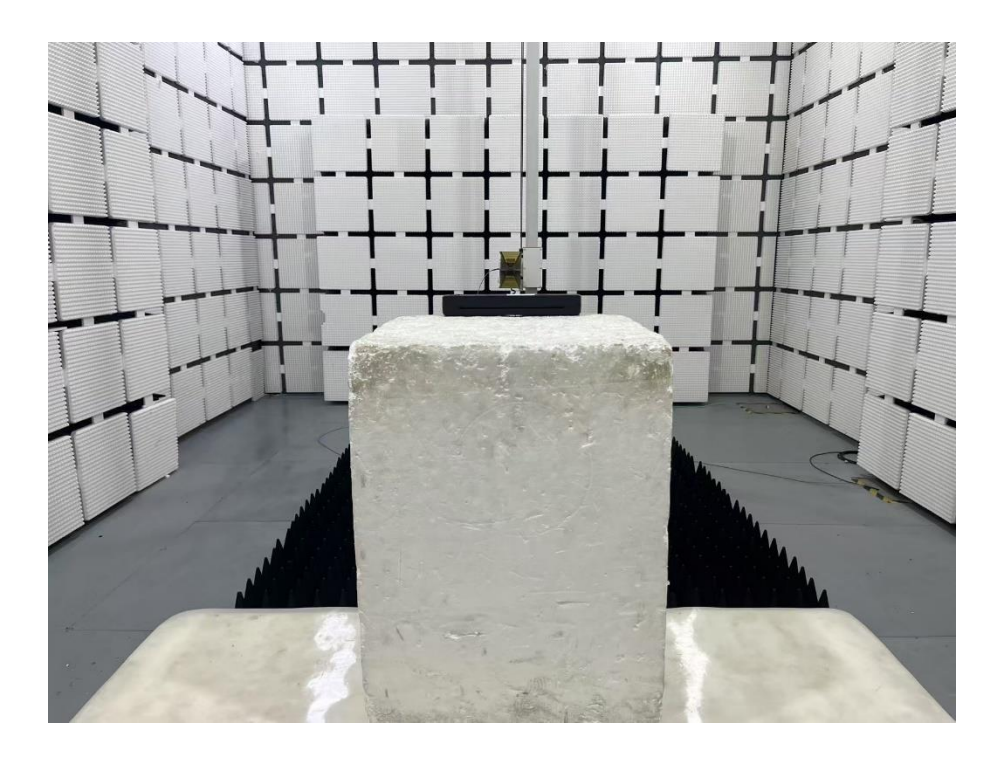
Set-up for Radiated Spurious Emission, Above 1GHz