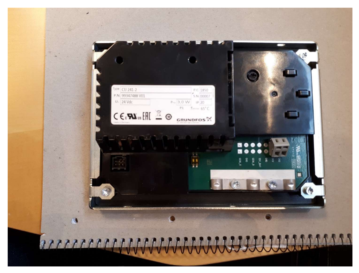
Figure 4Position of label on backside of product. (Prototype unit, label information not correct)