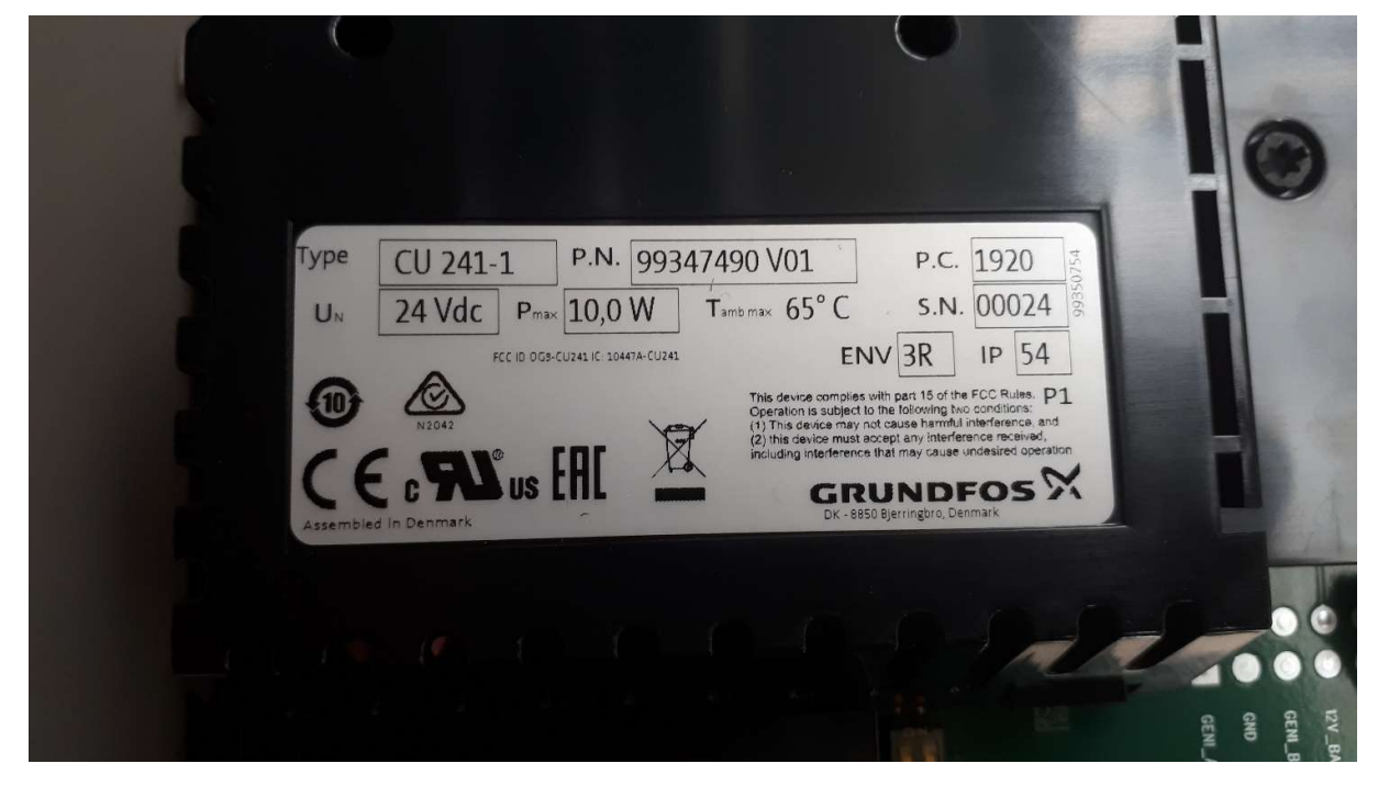
Figure 3 Label for CU 241-1

The HVIN is to be found in the type field of the label. The PMN is located on the front of the user manual.