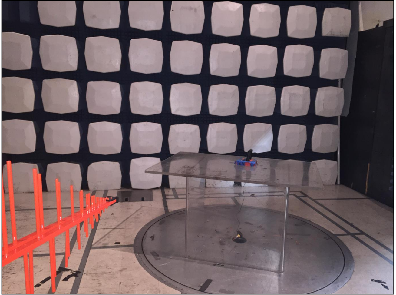
Photograph 4. Radiated Spurious Emissions, Test Setup