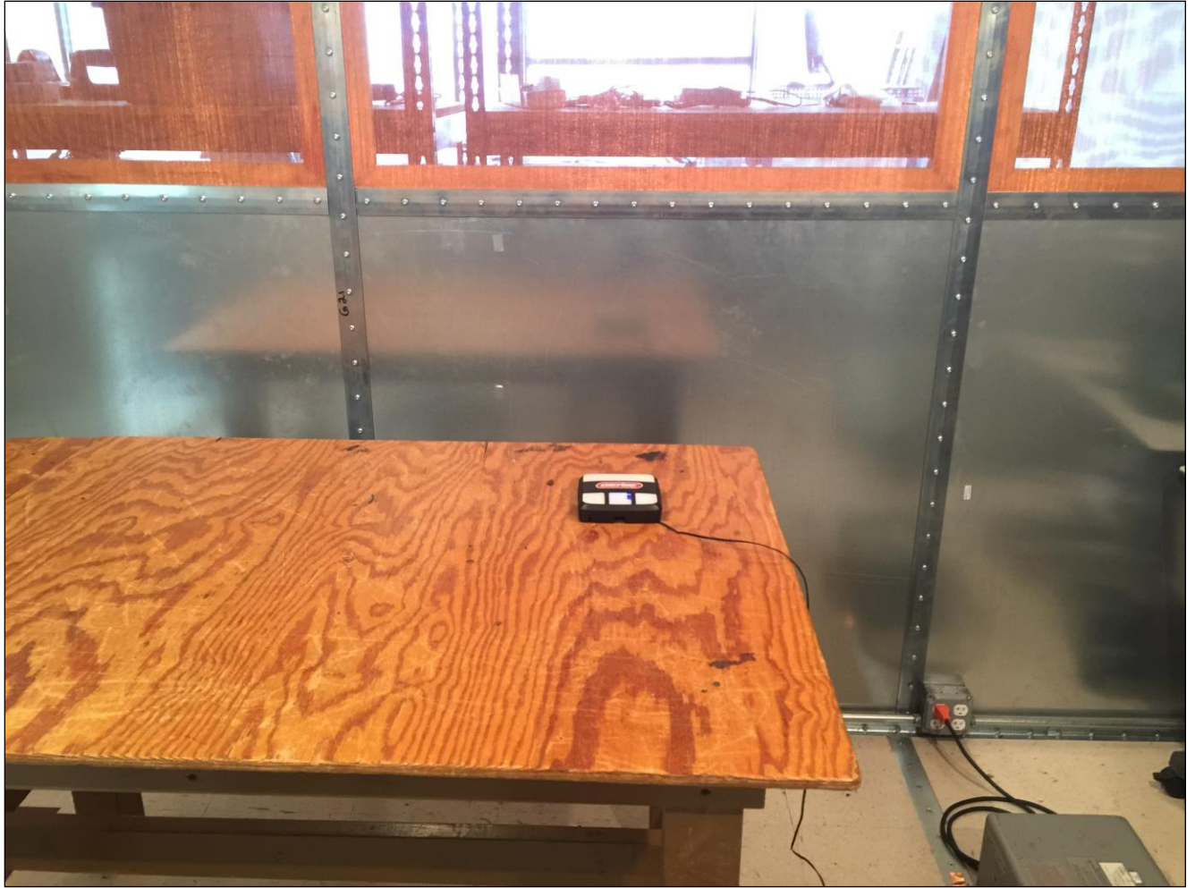
Photograph 3. Conducted Emissions, 15.207(a), Test Setup