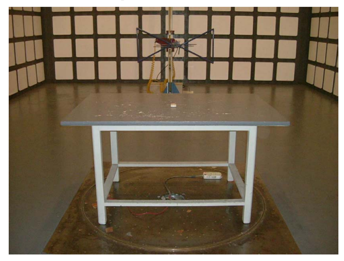
Front View of Test (Low Frequency)

1. Radiated & Fundamental And Spurious Emissions Test