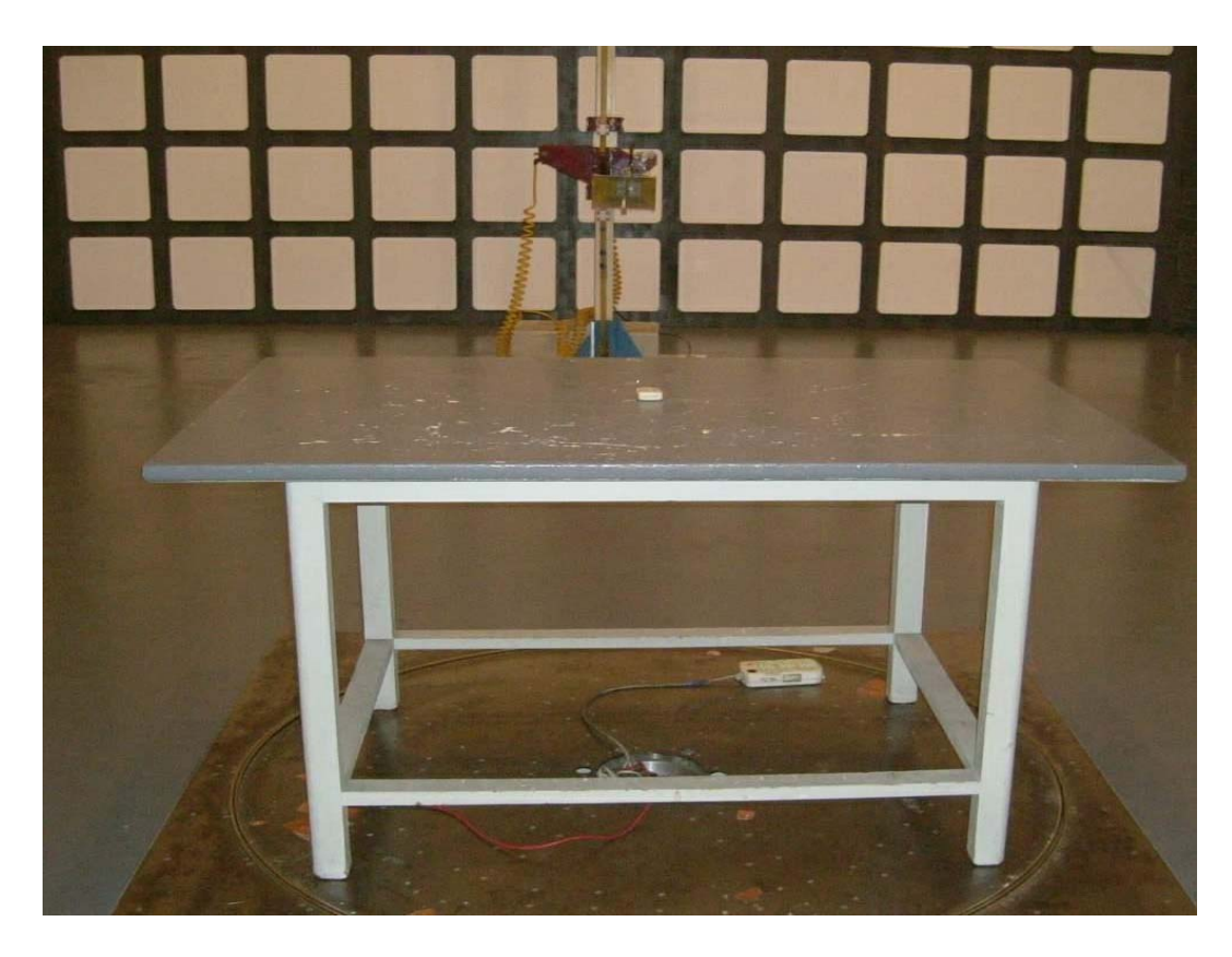
BACK VIEW OF TEST (HIGH FREQUENCY)