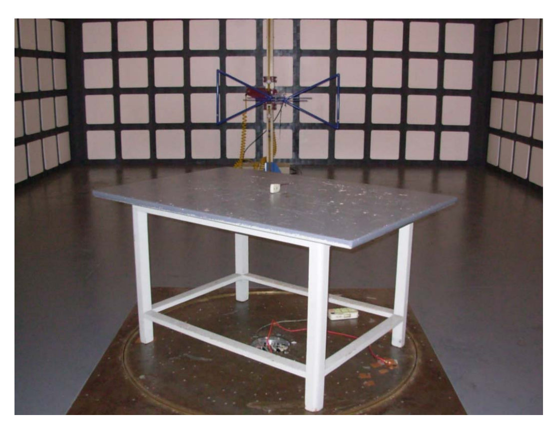
SETUP WITH MAXIMUM DETECTED EMISSION AT HORIZONTAL POLARIZATION (FOR ON SIDE TEST MODE)