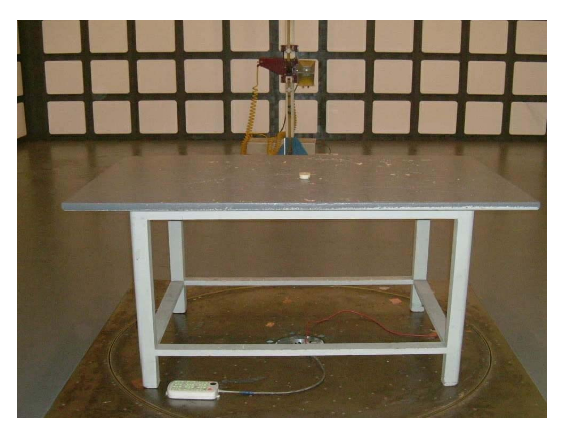
Front View of Test (High Frequency)