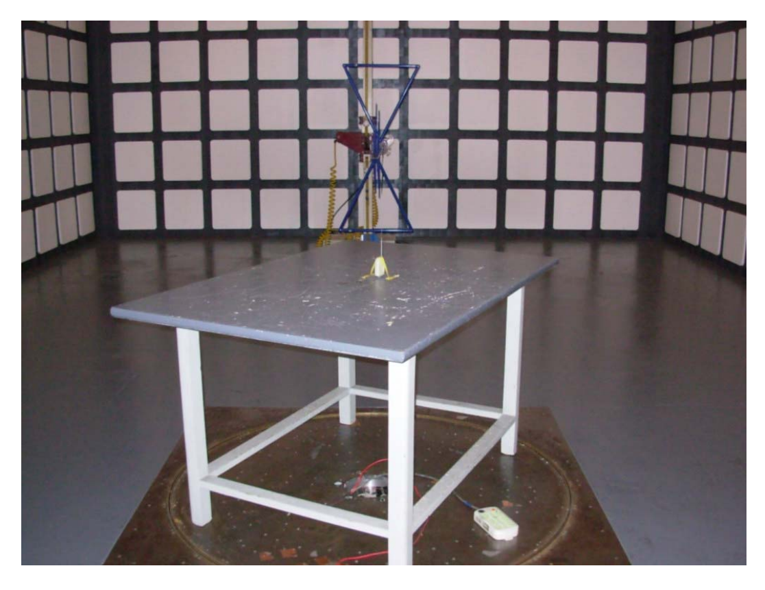
Setup with Maximum Detected Emission at Vertical Polarization (For On Stand test mode)