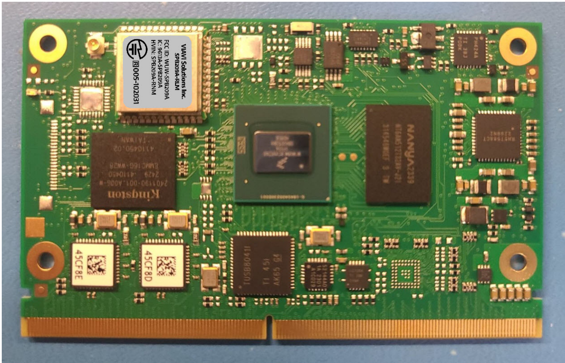
Daughter Board with Heatsink Removed Showing WiFi Module