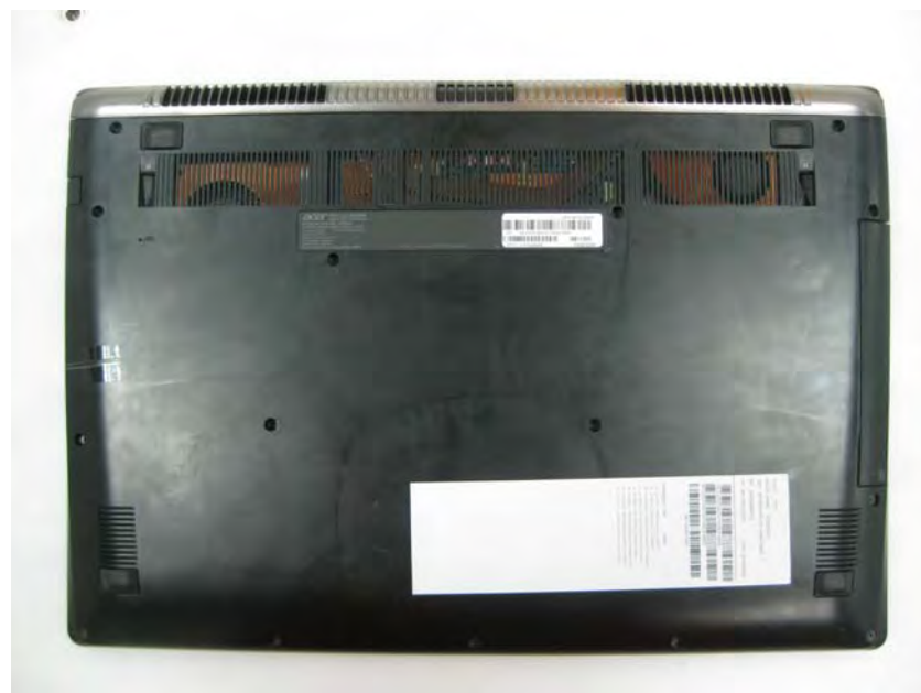
Fig.5 Back view of EUT