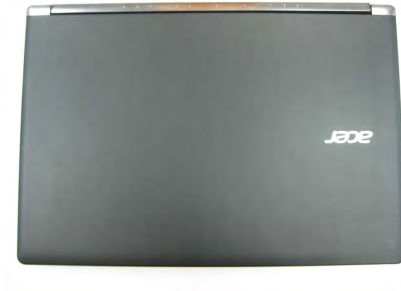
Fig.4 Front view of EUT