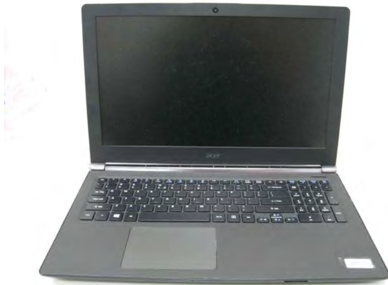
Fig.6 The screen portion of the laptop is in an open position at a 90° angle view of EUT