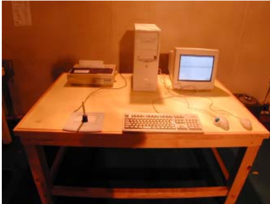
Photo 7.1 Setup with the Maximized RFI Voltage Emission Level