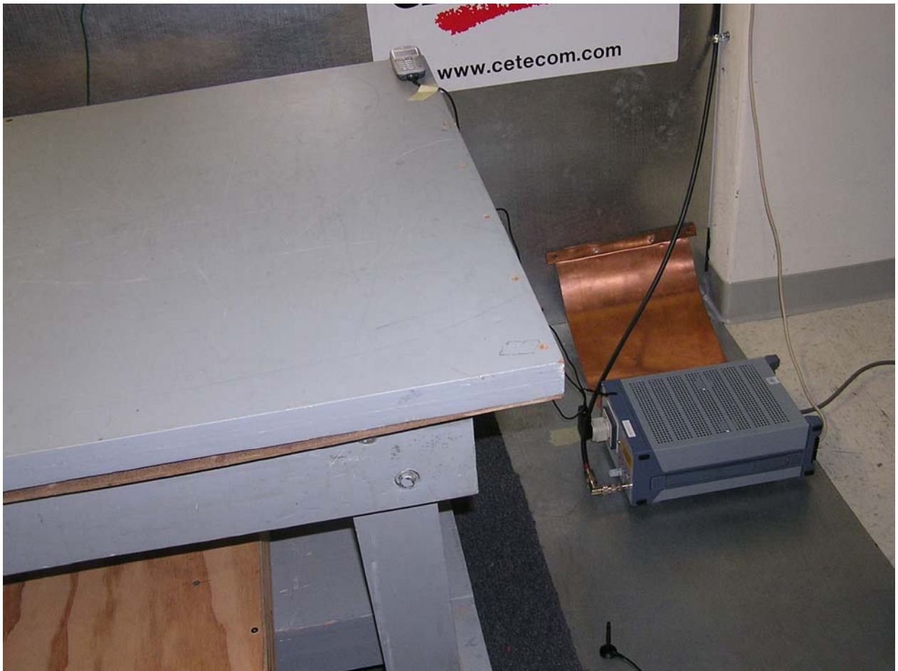
AC LINE CONDUCTION