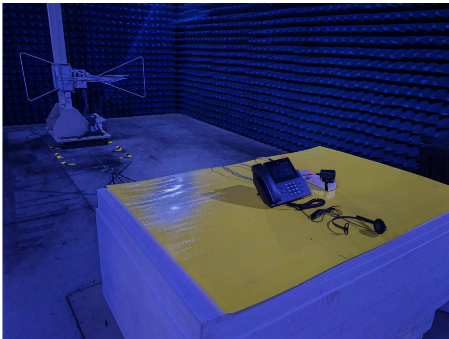
Powered by POE