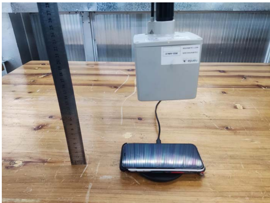
Test Position F-20cm from the edge of EUT to the geometric center of the probe