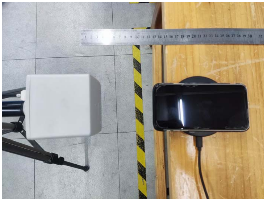
Test Position D-15cm from the edge of EUT to the geometric center of the probe