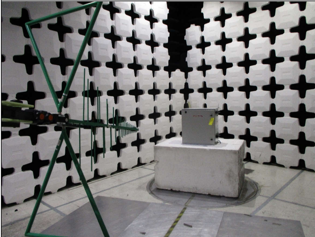
Test Setup for Spurious Radiated Emissions, 30-1000MHz – Antenna Polarization Vertical