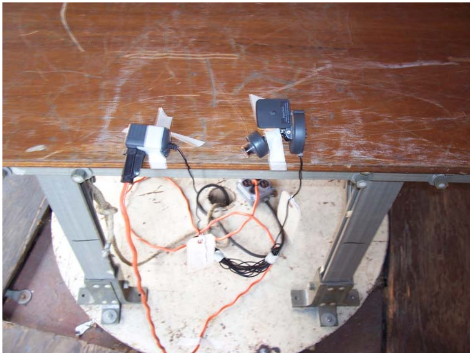
Radiated Emissions, Fundamental and Harmonics, Y-Axis