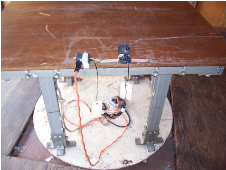
Radiated Emissions, Spurious Test Setup