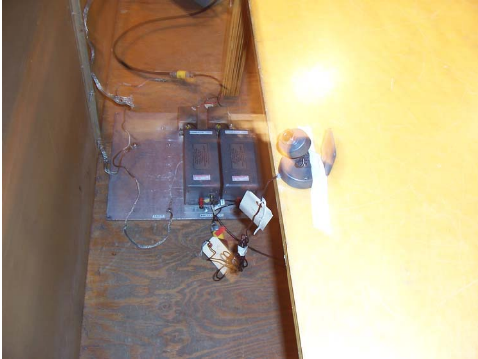
Conducted Emissions, Rear