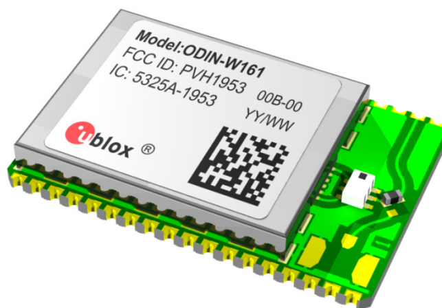
Figure-1 3D-view of ODIN-W161 with FCC/IC identifier label

The FCC/IC identifier marking is a label affixed on the shield cover.