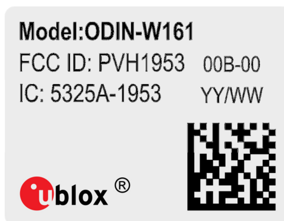
Figure-2 ODIN-W161 FCC/IC identifier label