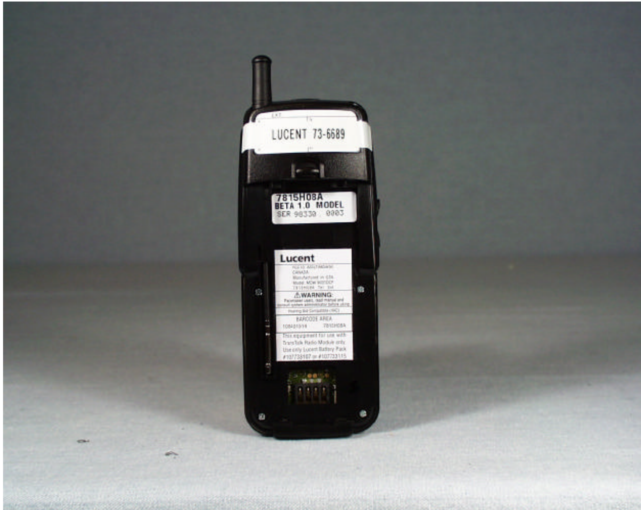
Photograph of the back exterior of the handset, showing the label placement.