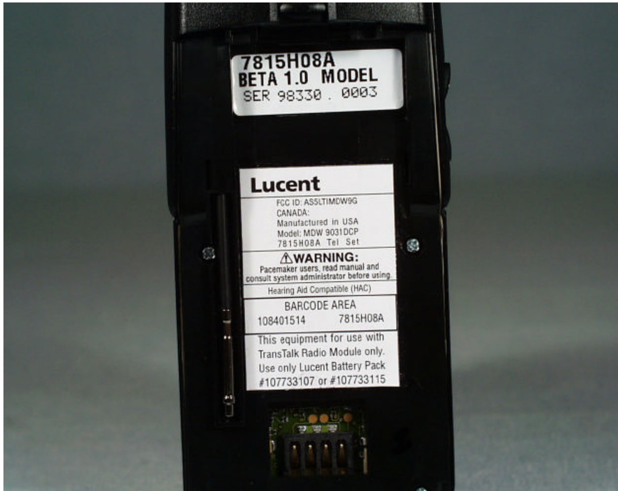
Photograph of the label on the back exterior of the handset.