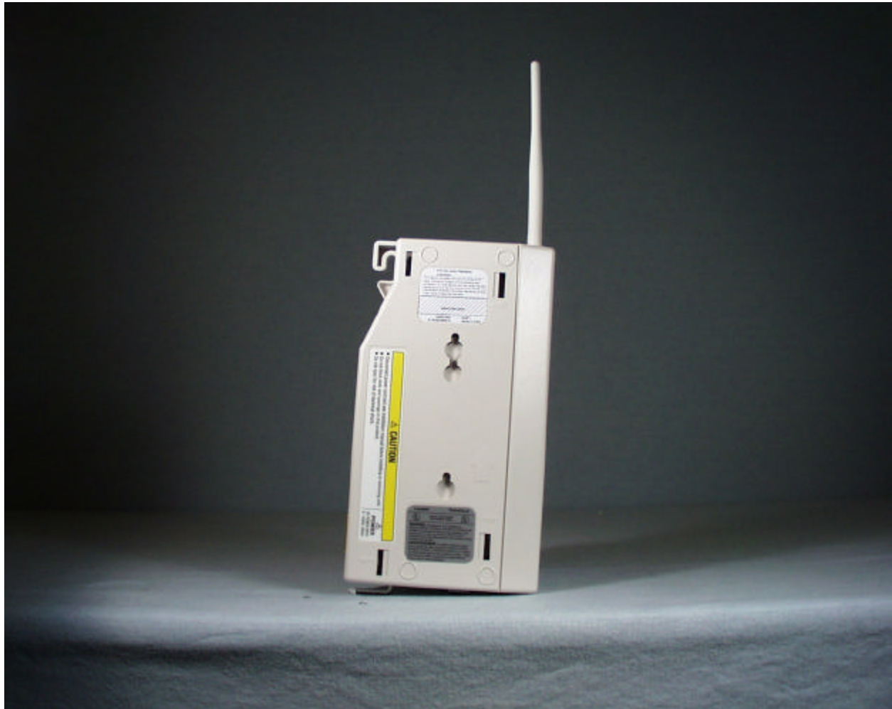
Photograph of the back exterior of the base, showing the label placement.

In accordance with the requirements of Sections 15.19 (a), 2.925 and 2.926 of the FCC Rules, the following information will be permanently affixed to the Lucent Technologies, Inc. Model MDW9031DCP as shown in the photograph below. The FCC ID number is located on both the base and the handset, but due to the size of the handset the compliance statement is located only on the base.