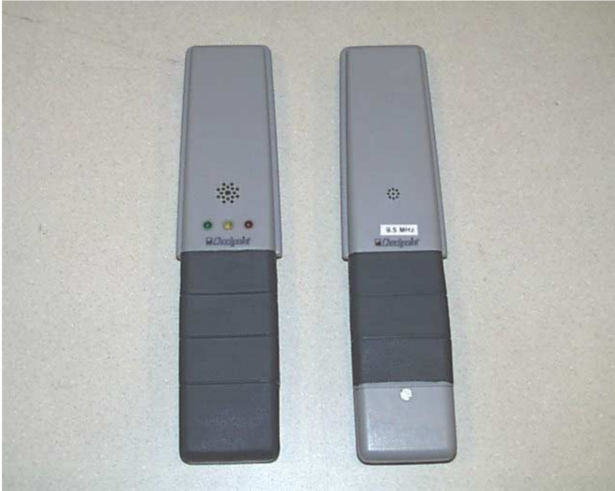
Photo 1 – View of Both Front (left) and Back (right) Halves of Enclosure