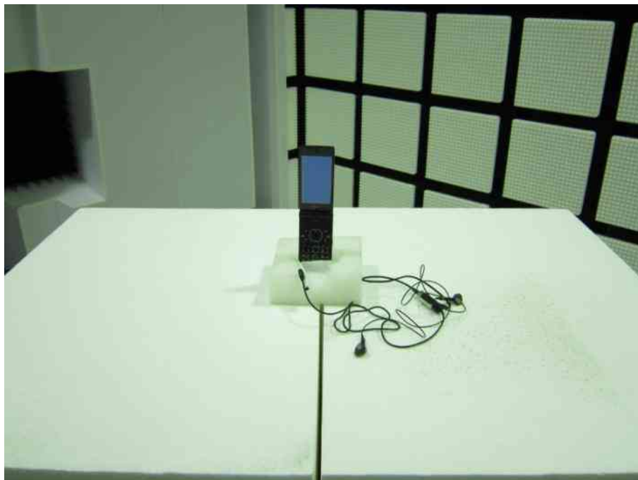
– Y-axis –