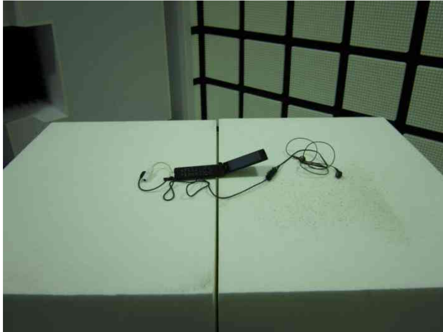
– X-axis –