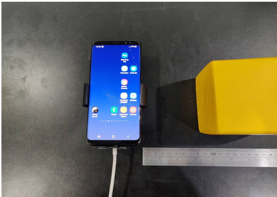
10 cm distance