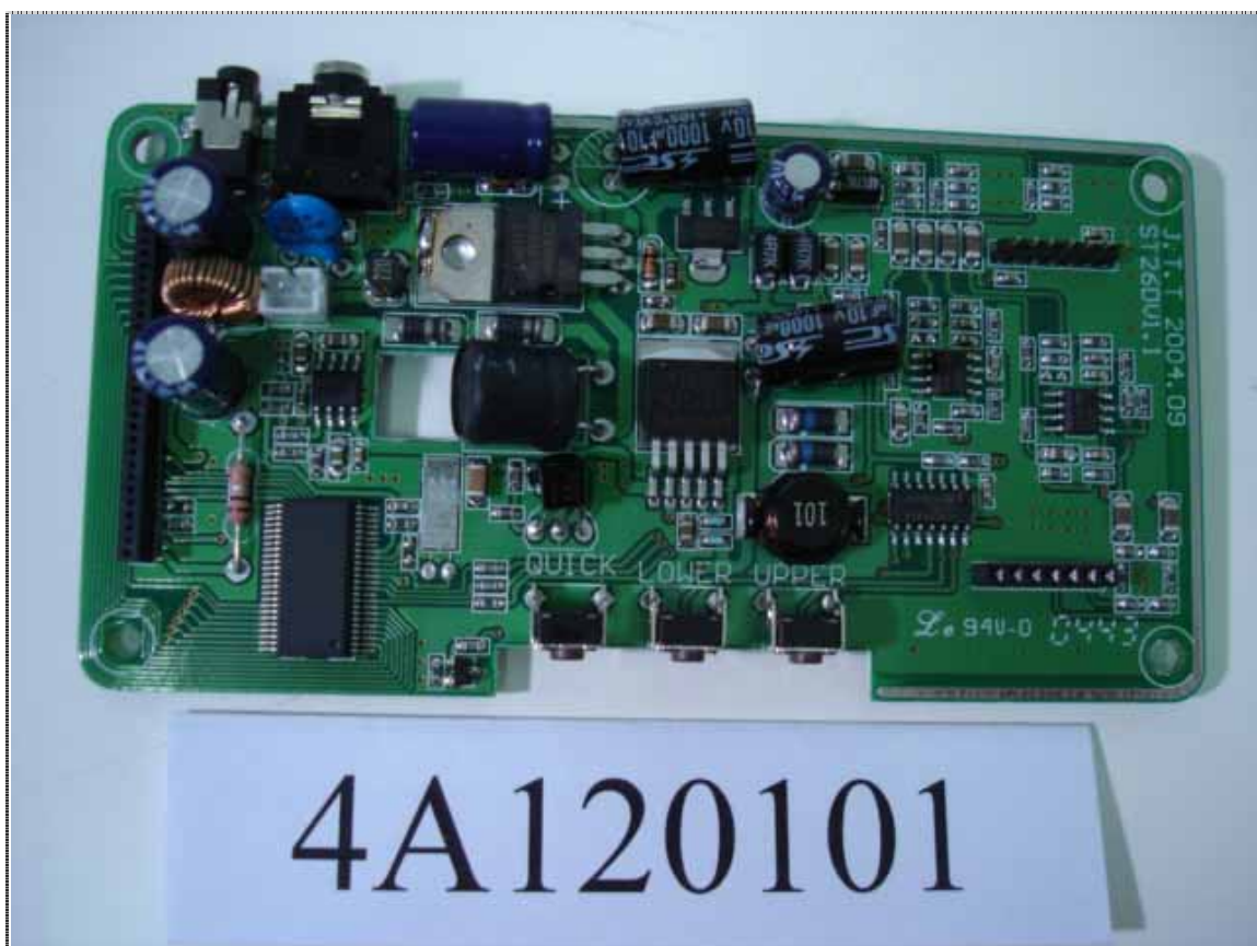
Component View of Main Board