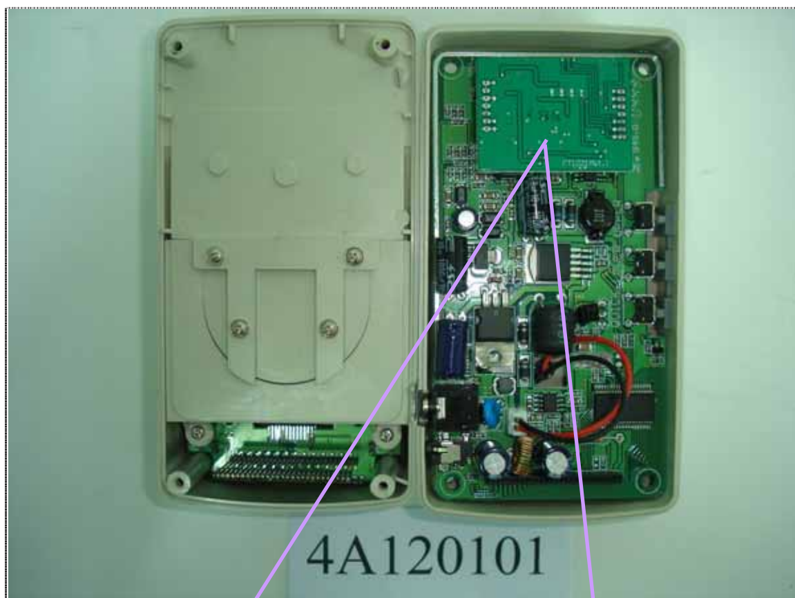
Open Case of EUT