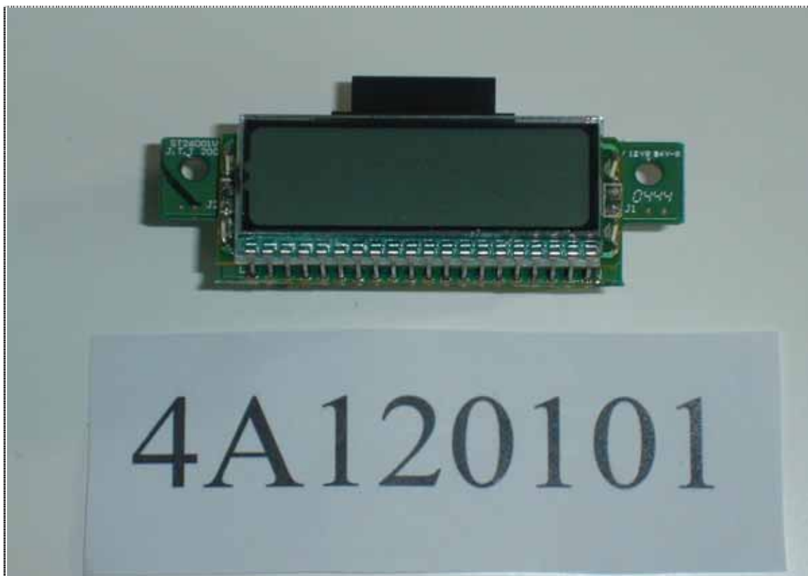
Component View of Panel Board