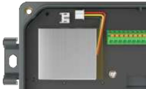
Figure 12.5. Battery plug removed.