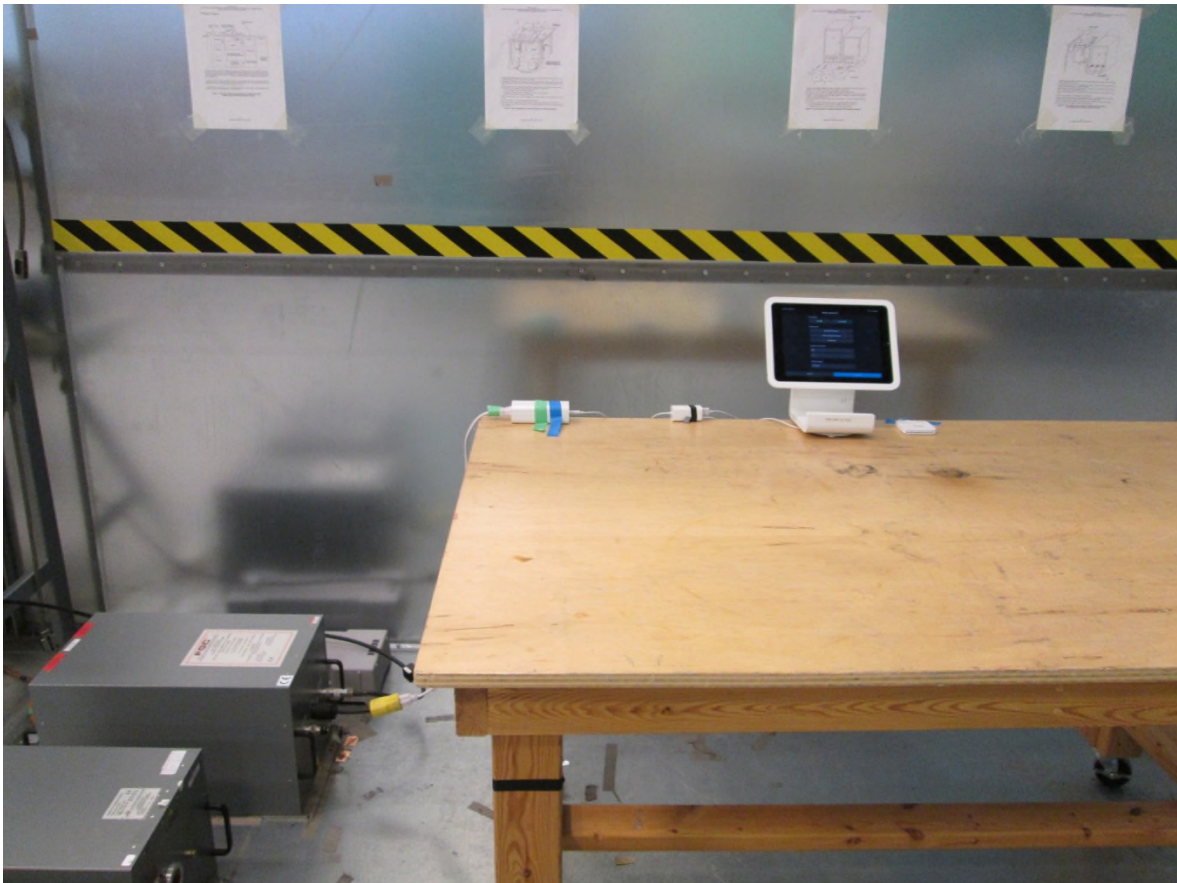
NFC Test setup photo 3 Power line conducted emissions measurements