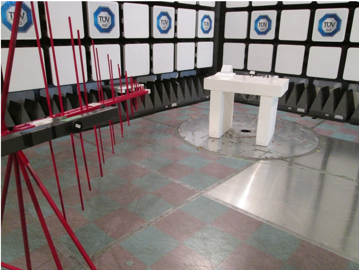
NFC Test setup photo 2 Radiated measurements, 30 MHz – 1 GHz