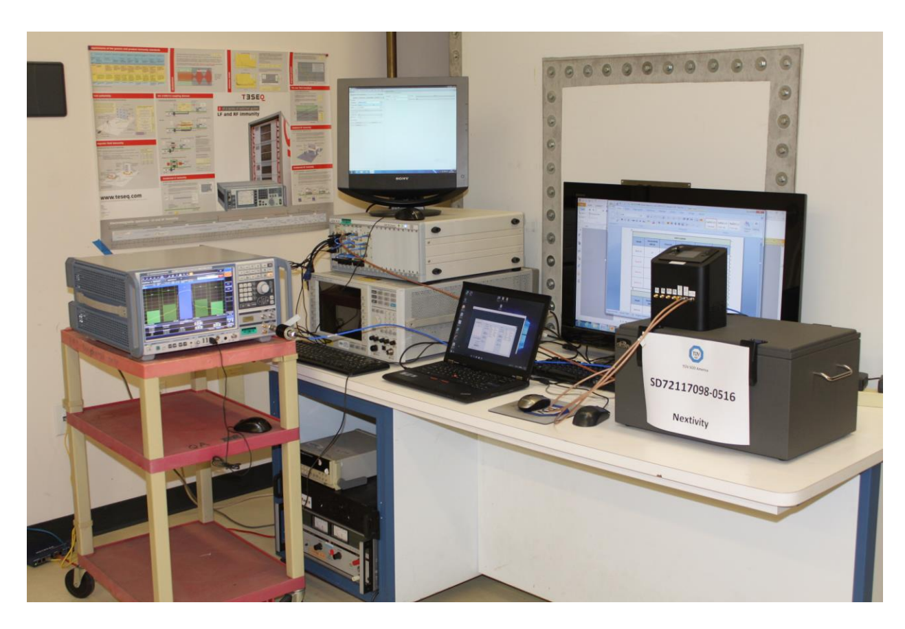
Conducted Port Test Setup