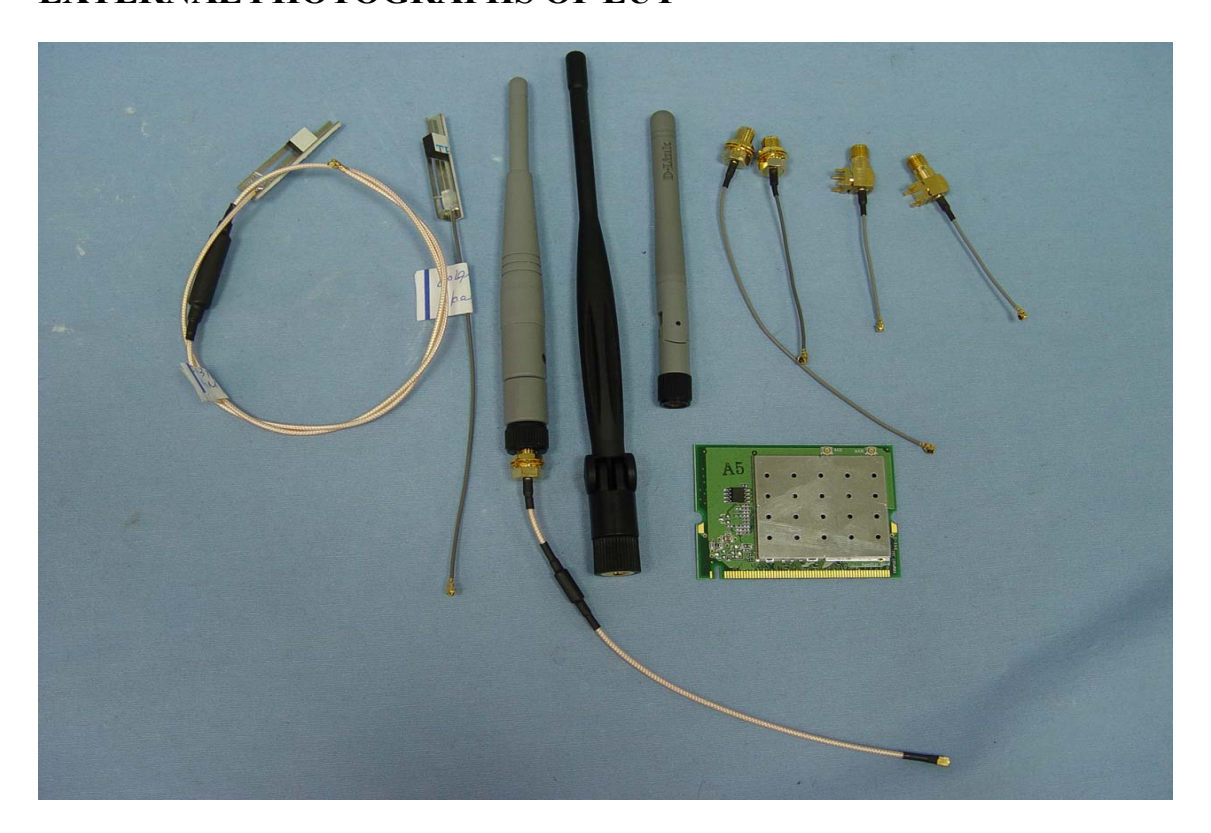
Model / Gain: SA2-05035-A5 / 5.0 dBi