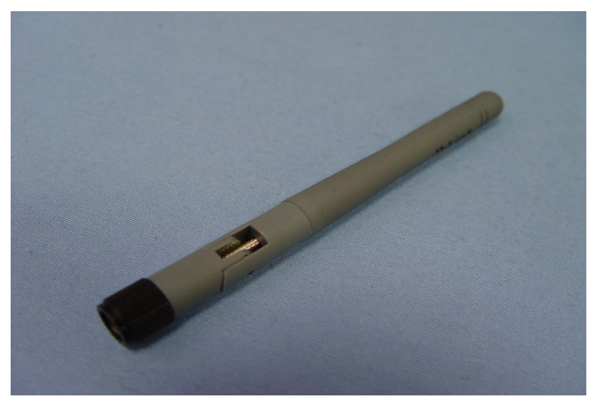
Model / Gain: THW0234A / 2.0 dBi