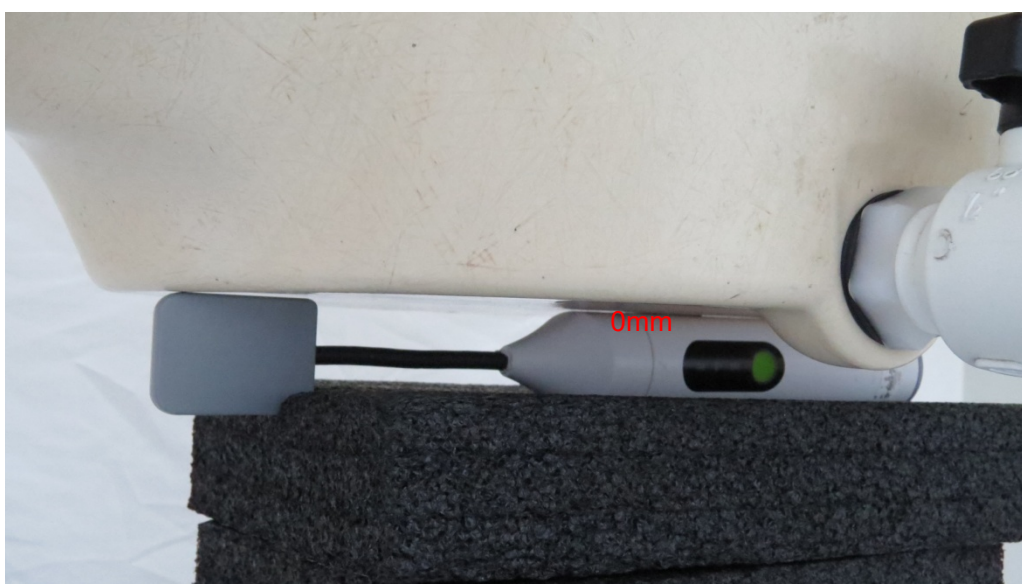
Picture 4: Right Edge, the distance from handset to the bottom of the Phantom is 0mm