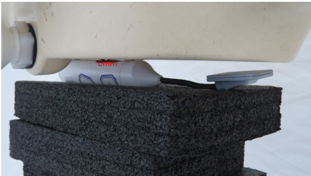
Picture 2: Front Side, the distance from handset to the bottom of the Phantom is 0mm