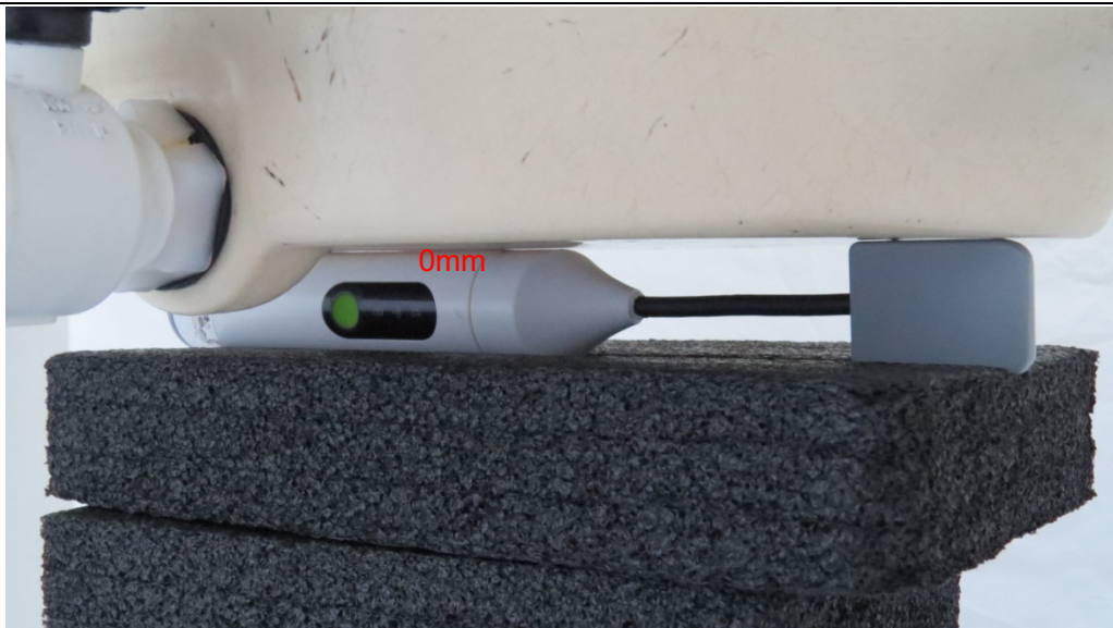
Picture 3: Left Edge, the distance from handset to the bottom of the Phantom is 0mm