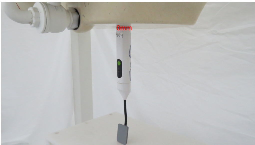
Picture 5: Bottom Edge, the distance from handset to the bottom of the Phantom is 0mm