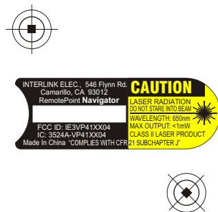
Artwork P/N 10-34785 Rev. P2 For S/N Label 20-58755