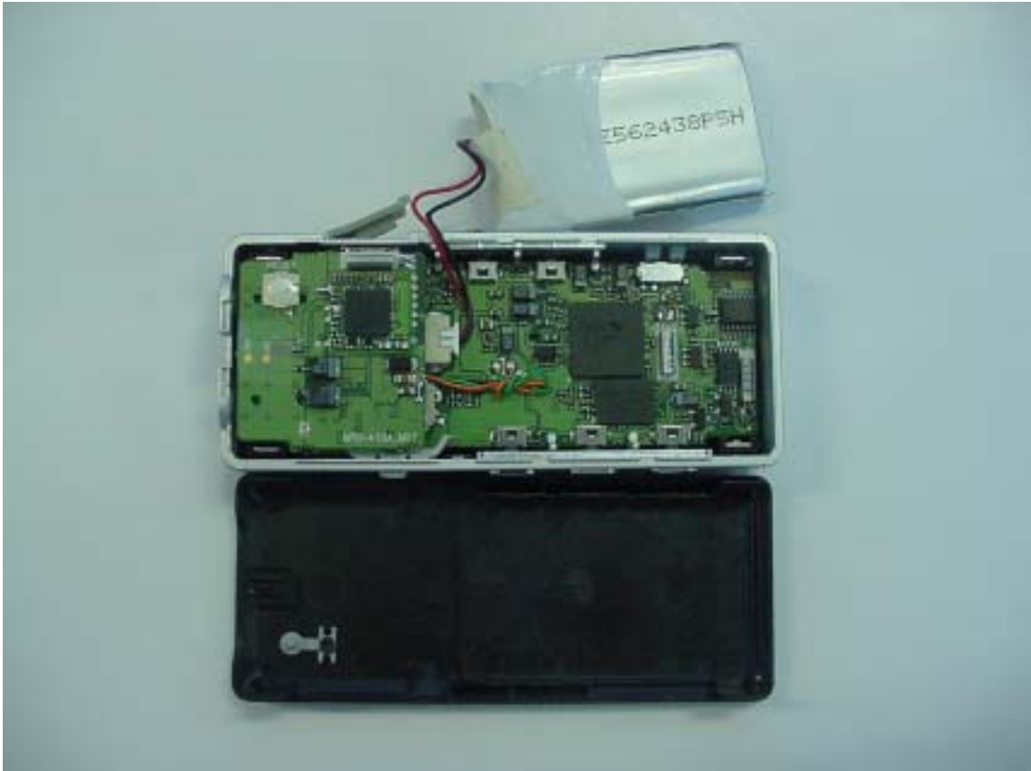
<INNER SIDE OF EUT>