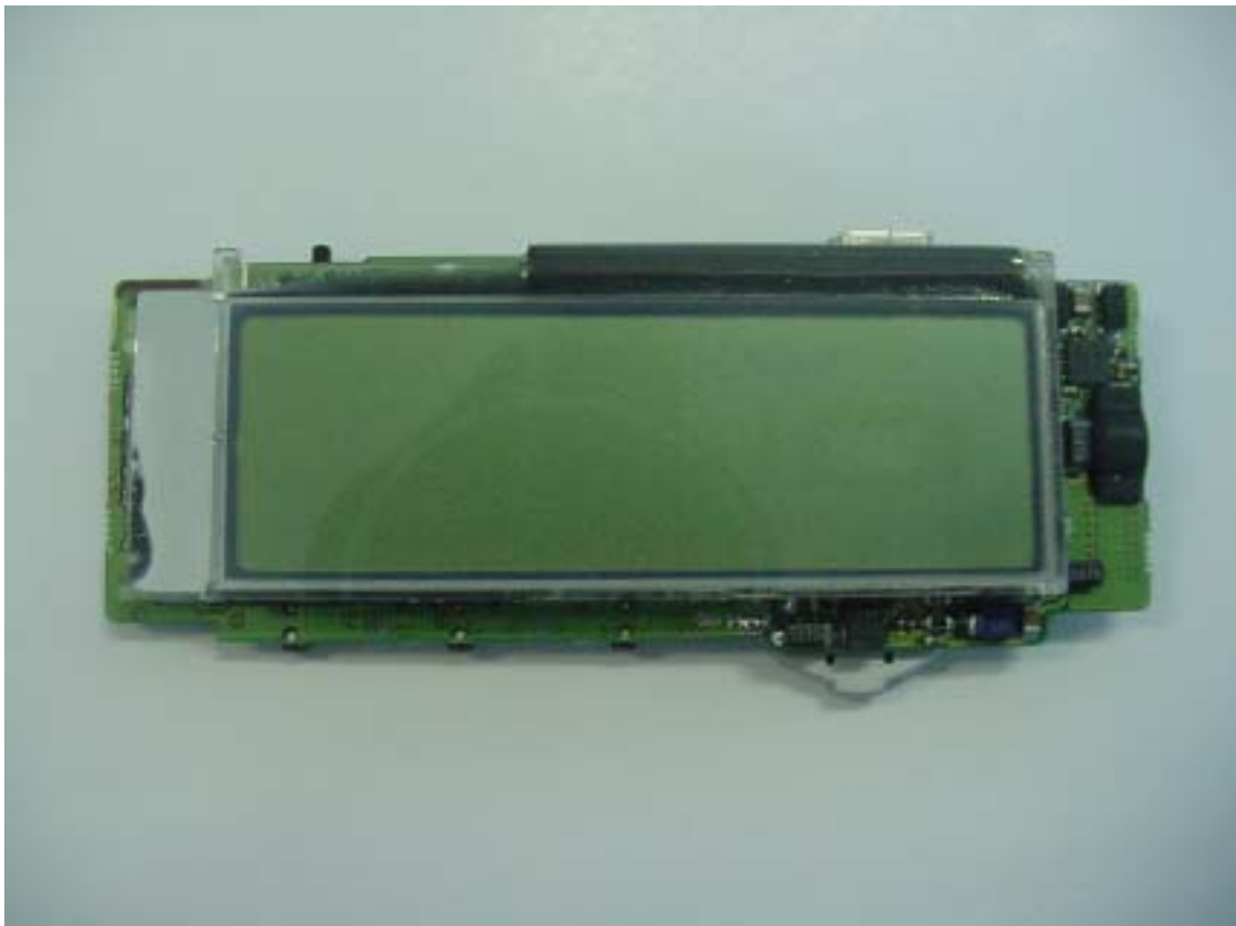
<FRONT SIDE OF MAIN BOARD>