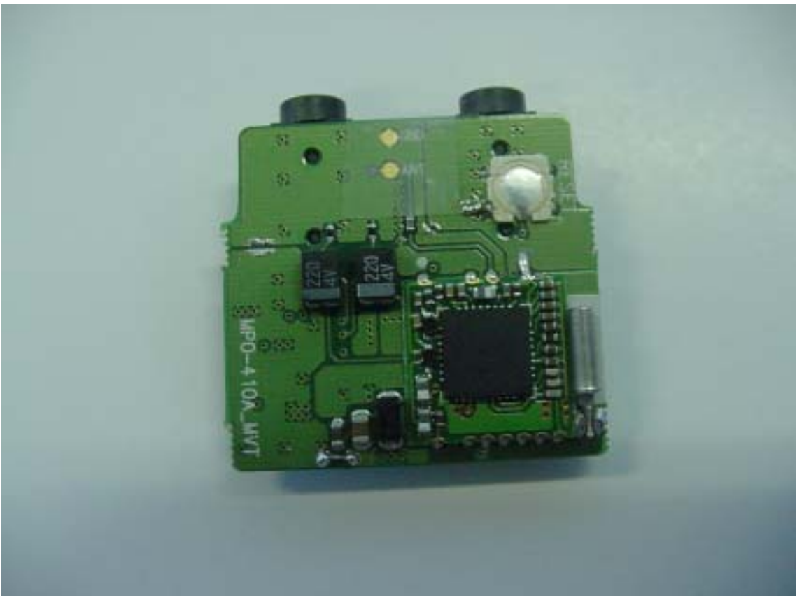
<FRONT SIDE OF INTERFACE BOARD>