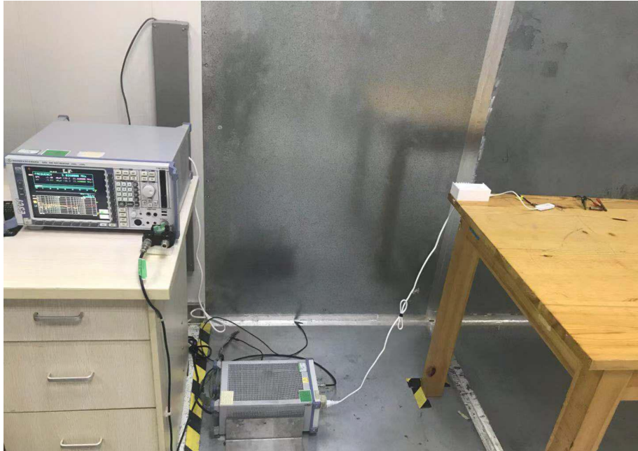
Radiated Spurious Emissions Test Frequency From 30MHz-1000MHz