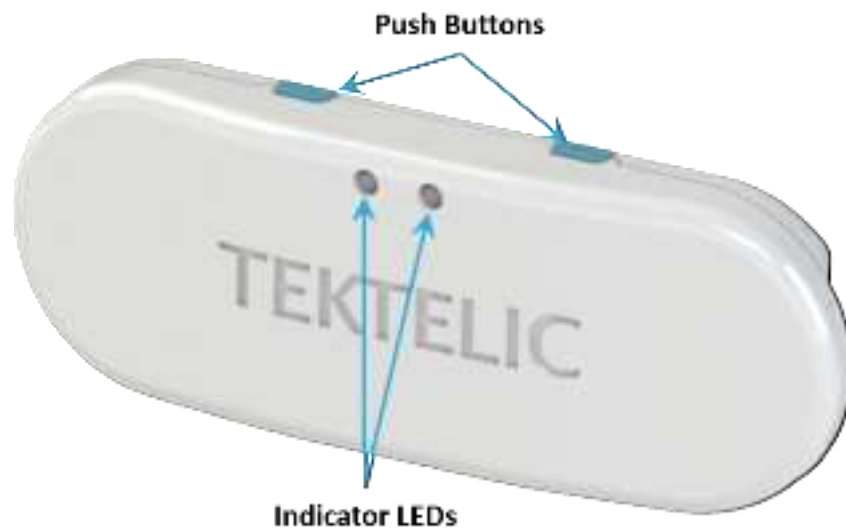
(a) Front View