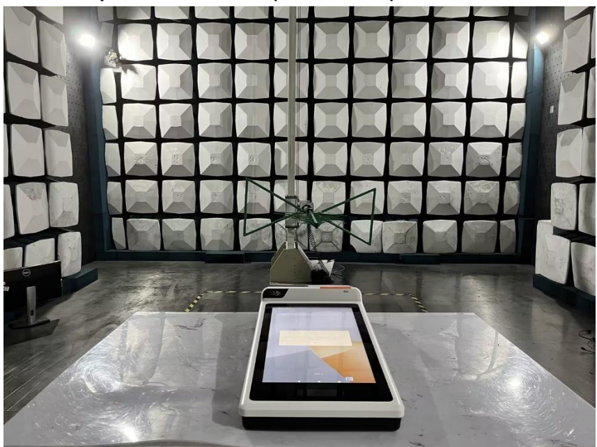
Radiated Spurious Emissions (Above 1GHz)