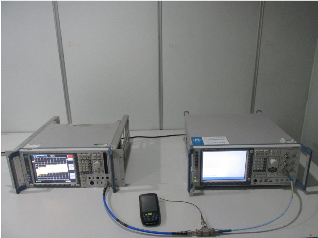
Radiated Test setup photos