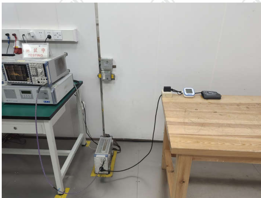
Conducted Emissions Test Setup