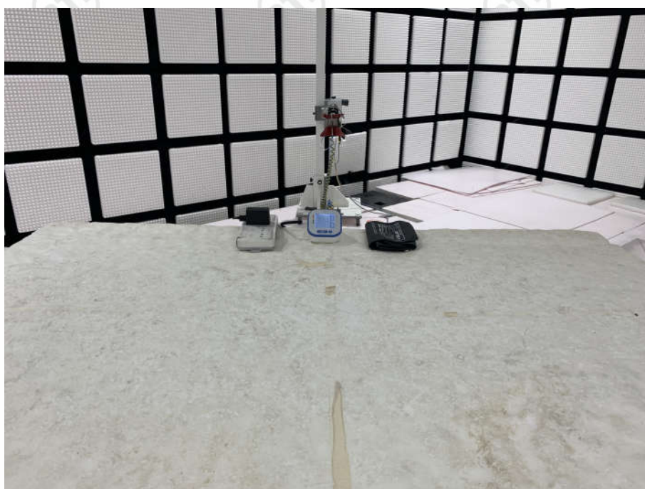
Radiated spurious emission Test Setup-2(Above 1GHz)