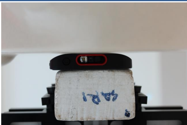
Back at 0mm