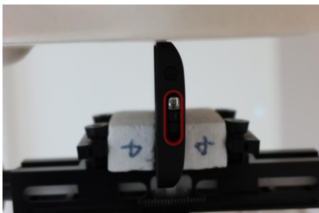
Left side at 0mm