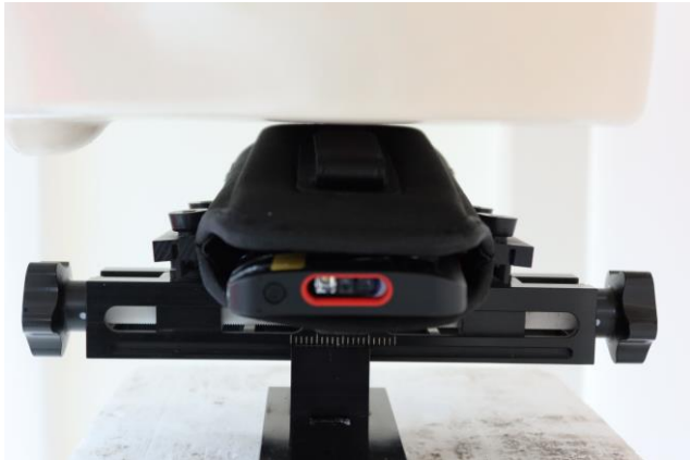
Back with Holster 1 at 0mm