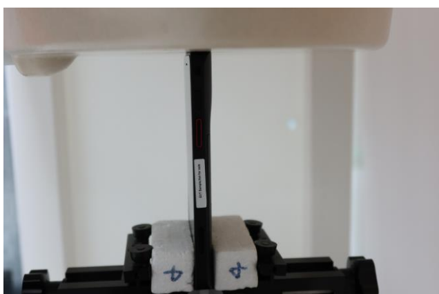
Top side at 0mm