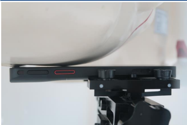
Right Cheek at 0mm