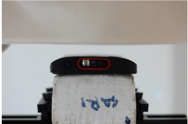
Back at 15mm