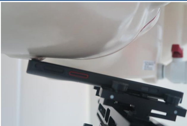
Right Tilted at 0mm