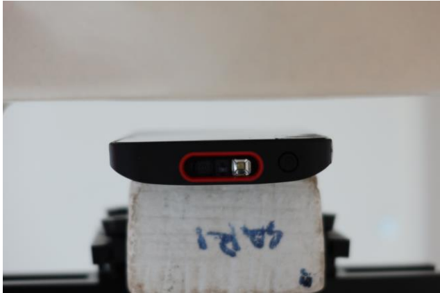
Front at 15mm