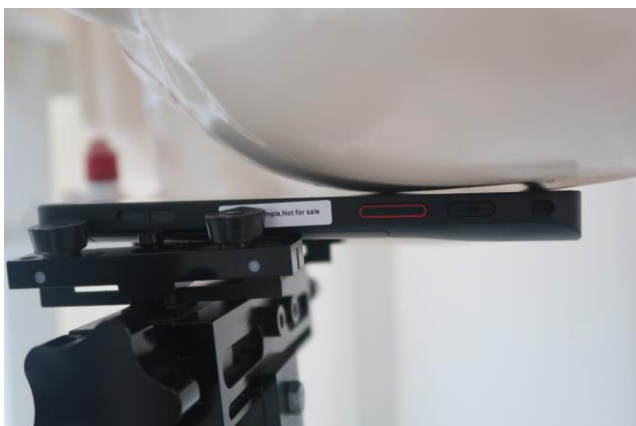
Left Cheek at 0mm