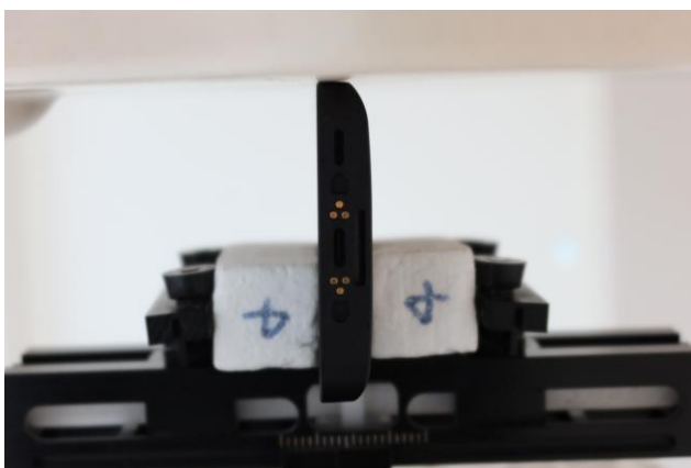
Right side at 0mm