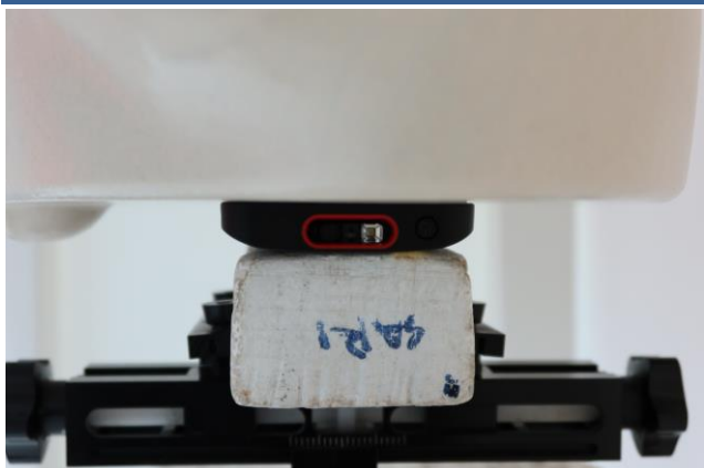
Front at 0mm