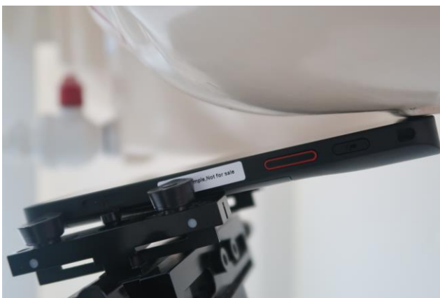
Left Tilted at 0mm