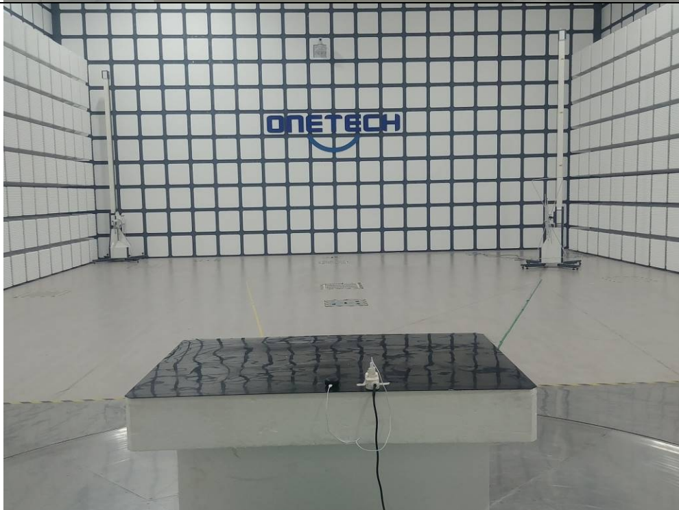
Test Mode 1 (Charging)