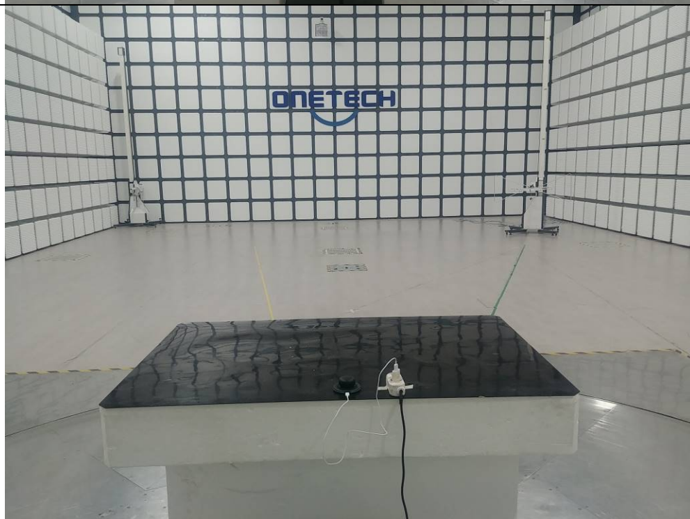
Test Mode 2 (Wireless Charging)