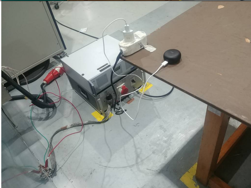
Test Mode 1 (Charging)