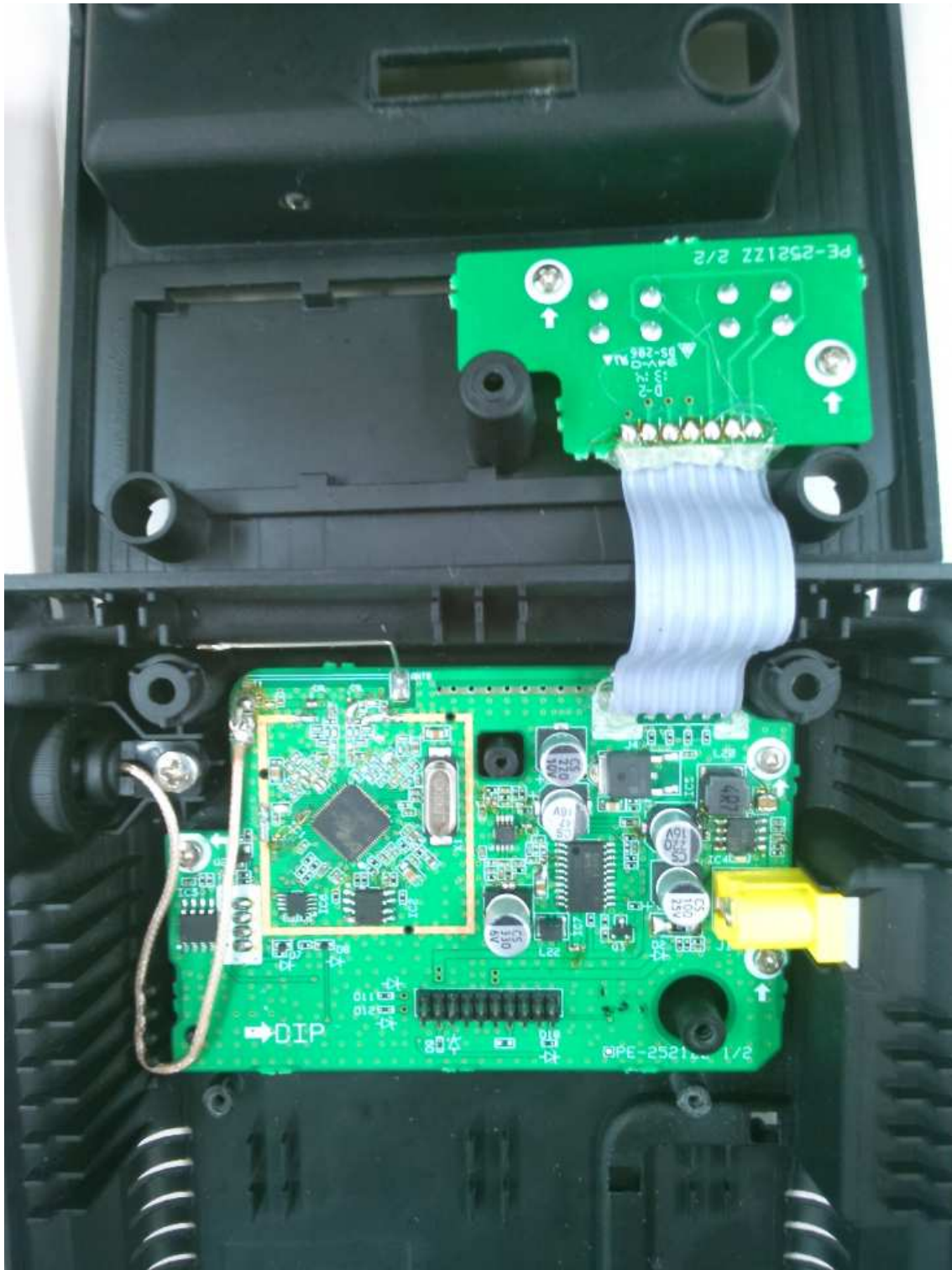
Main PCB Top View & Key PCB Bottom View [ “EXP11000” Base]