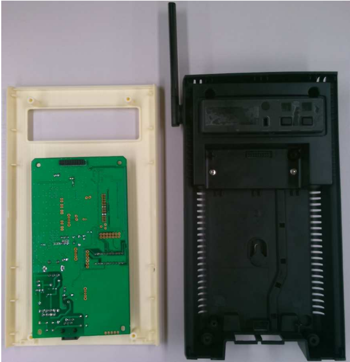
I/F PCB Bottom View [ “EXP11000” Base]