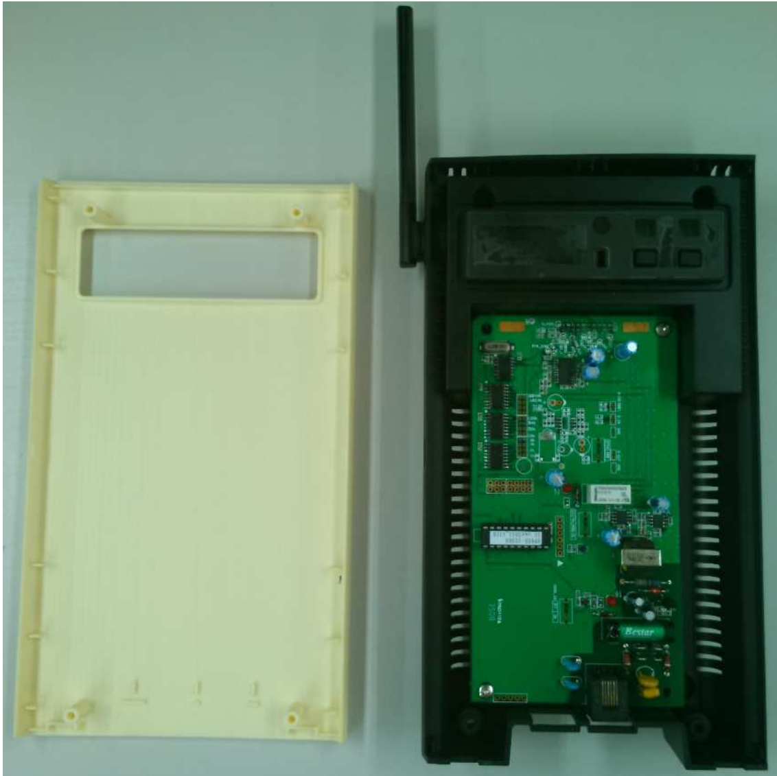
Front Cover Opened [ “EXP11000” Base]