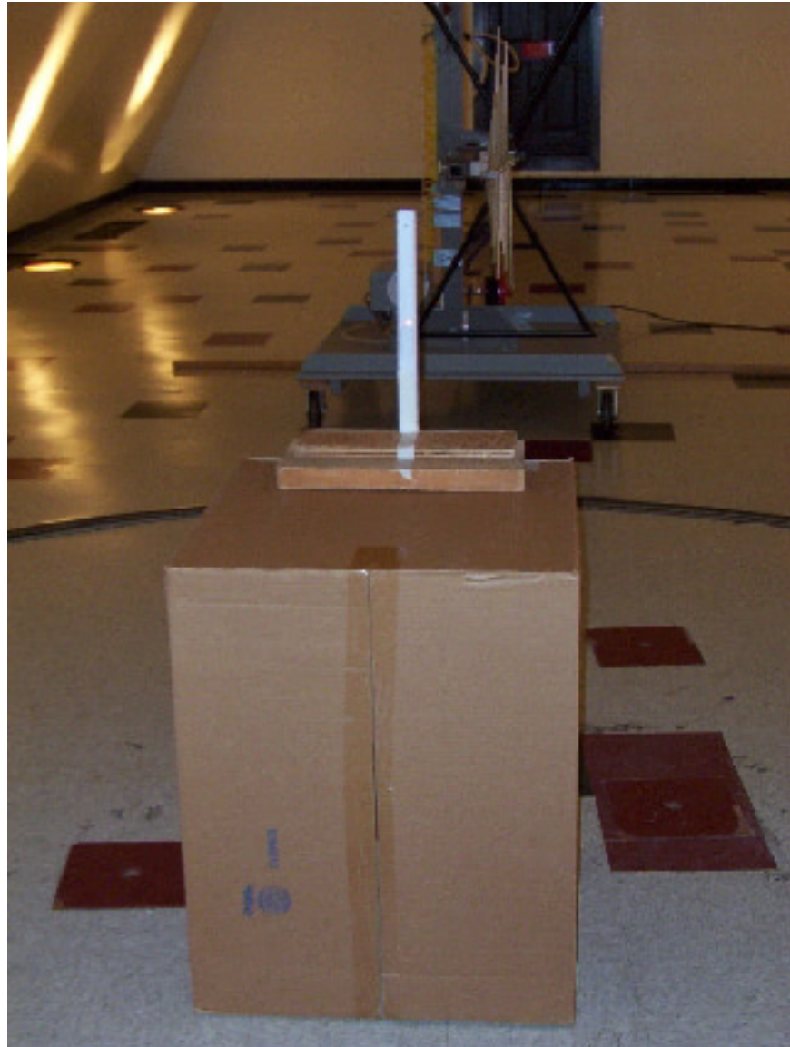
Radiated Emission Test Setup – Vertical Orientation, Front View