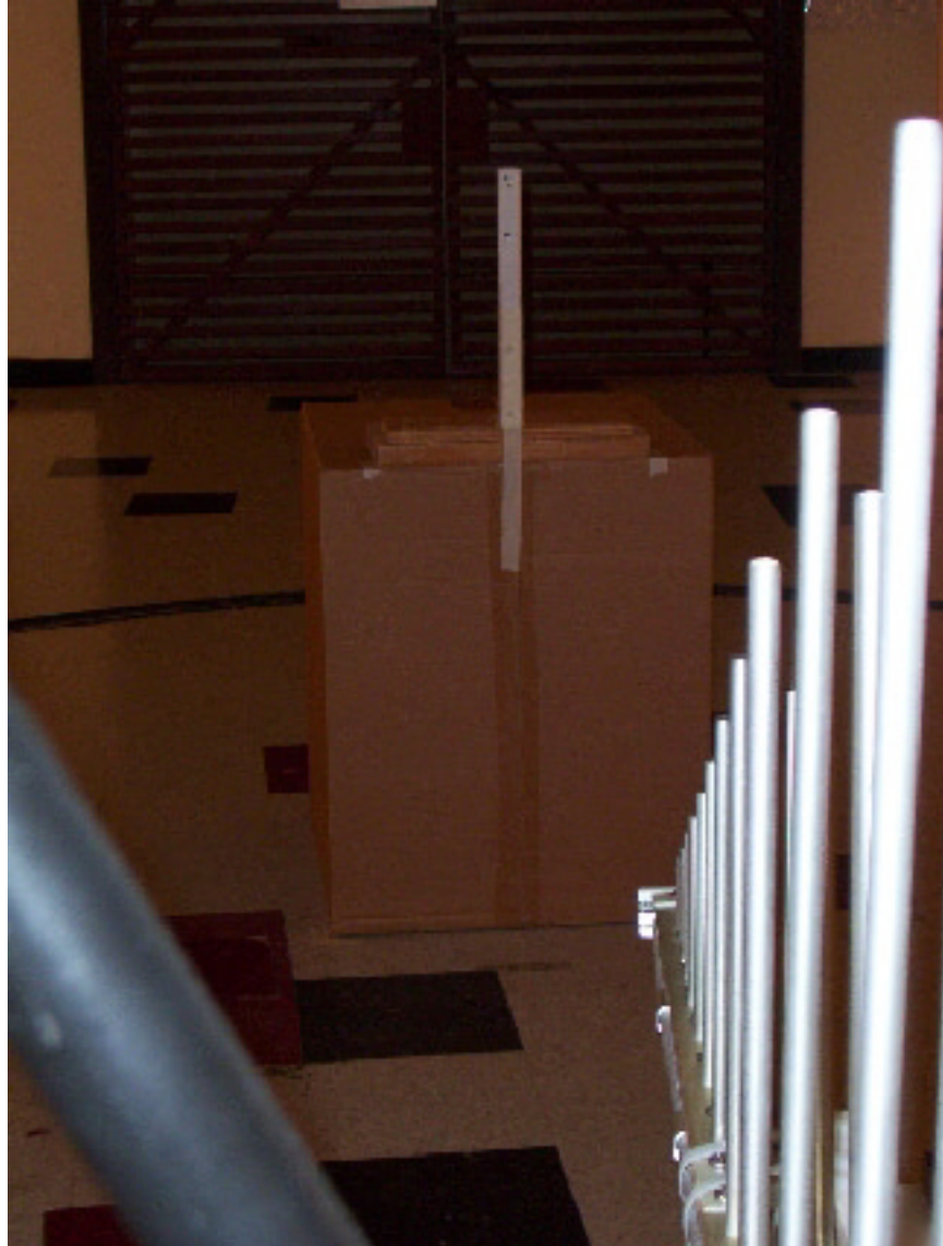
Radiated Emission Test Setup – Vertical Orientation, Rear View