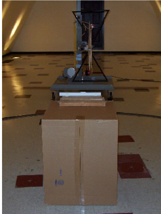
Radiated Emission Test Setup – EUT on Side, Tx Light Facing Up