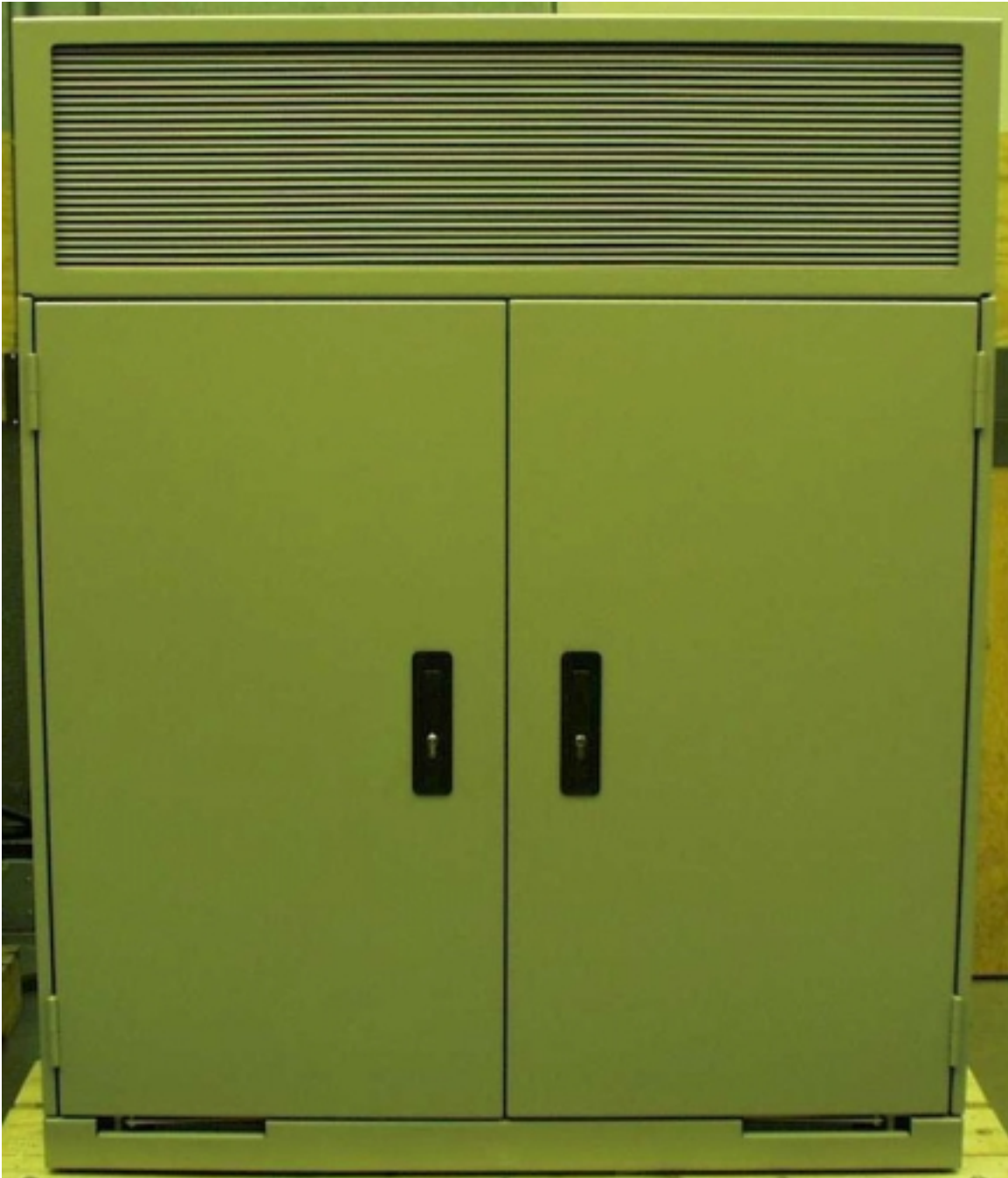
PHOTOGRAPH-1: FRONT VIEW OF OUT-DOOR MACROCELL