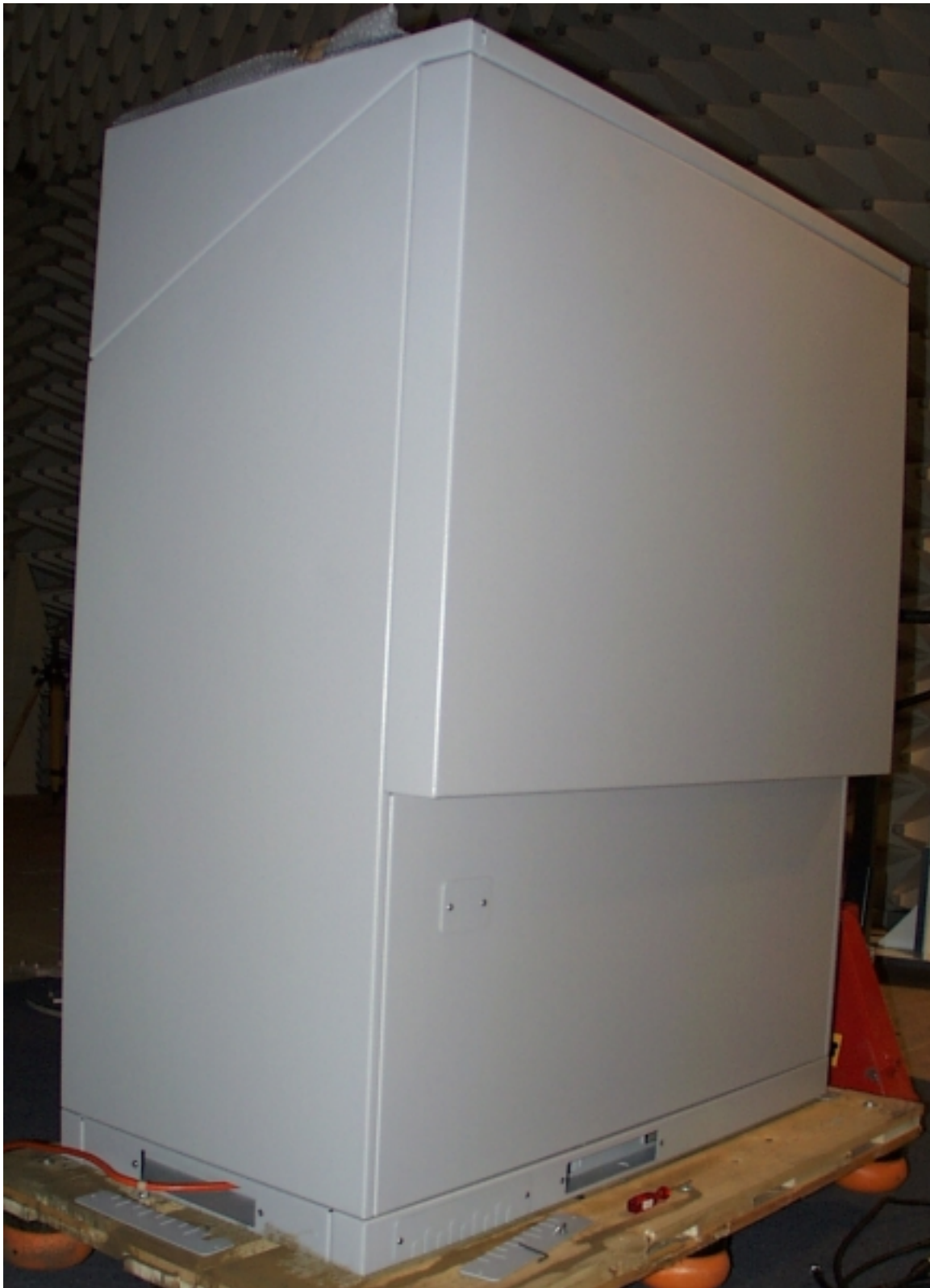
PHOTOGRAPH-3: REAR AND SIDE VIEWS OF OUT-DOOR MACROCELL