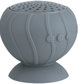
Portable Wireless Speaker User's Guide for Model No. SB05 v1177-01