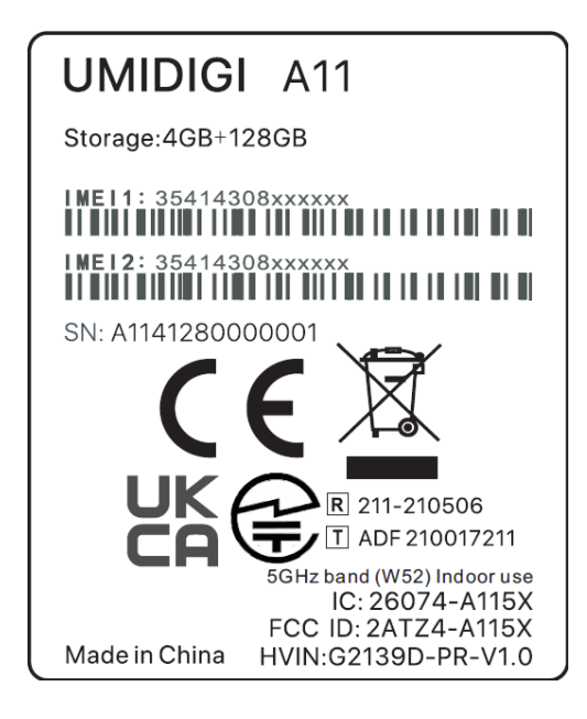
FCC ID Label Location Information