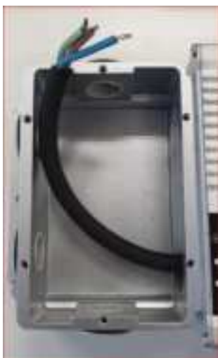
TE10 - JunctionBox

The TE11 and the HEP versions are provided with a C14 connector and are for all other cases, e.g. lockers put in front of a wall or at the end of desks. Those lockers are also often replaced by customers.