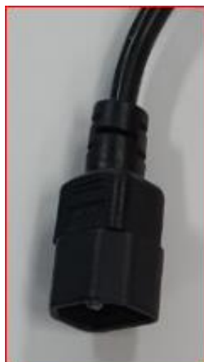
TE11 - C14

If the input is connected to a UPS, you can connect 1 large PSU or 2 small PSU to 1 UPS of 650VA.