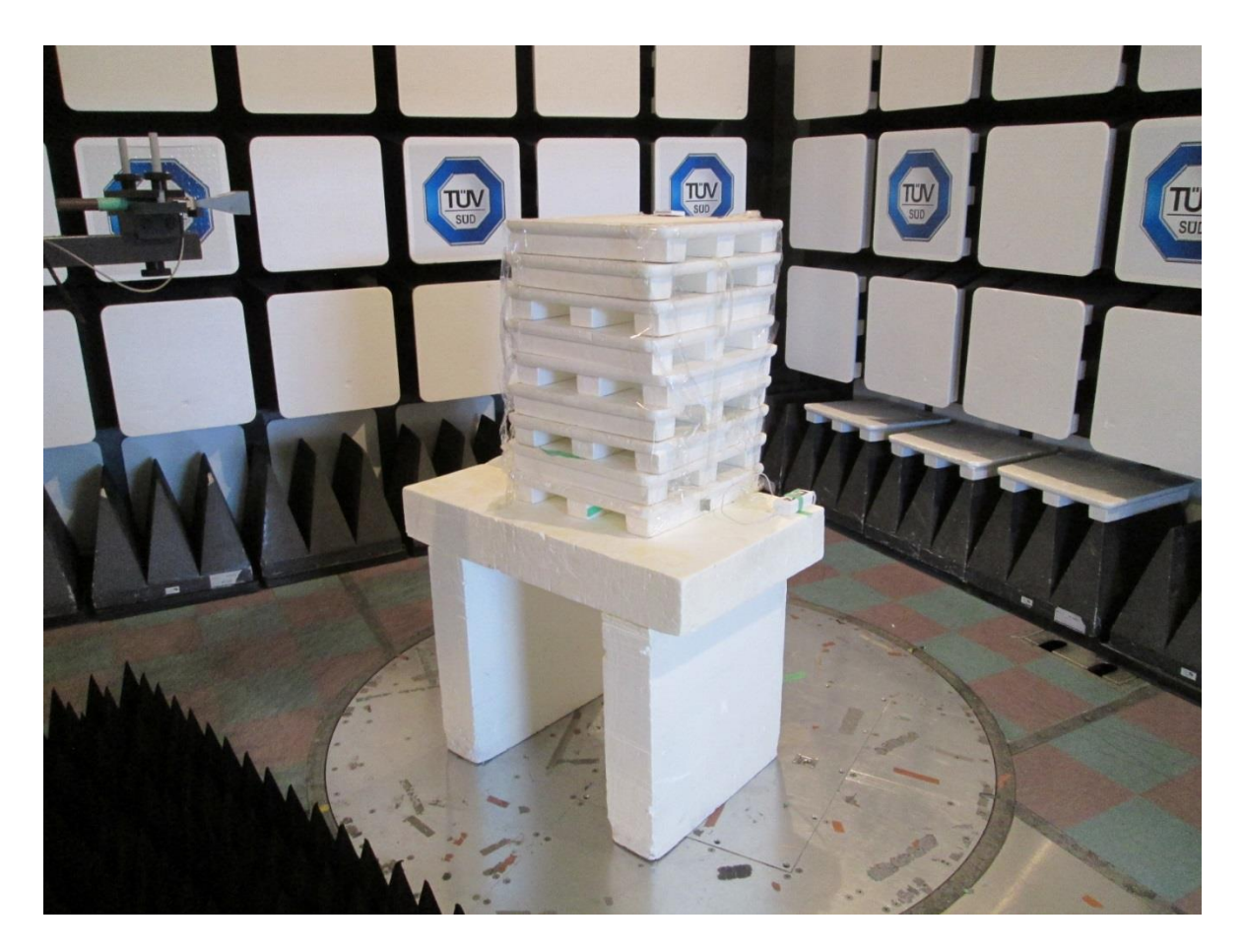
Test setup photo 6 Radiated measurements, 18 GHz – 26.5 GHz