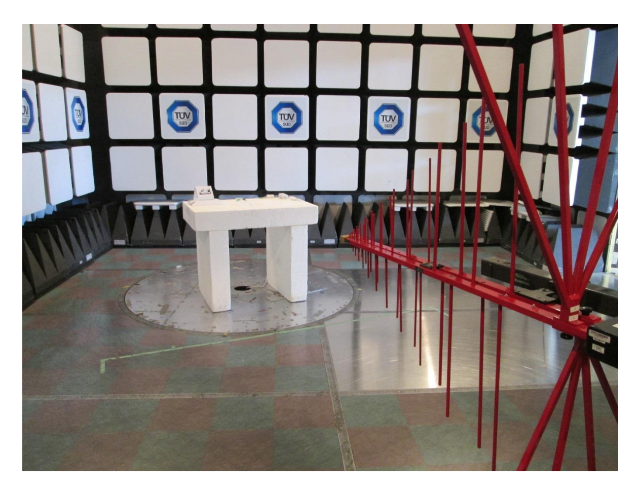
Test setup photo 2 Radiated measurements, 30 MHz – 1 GHz