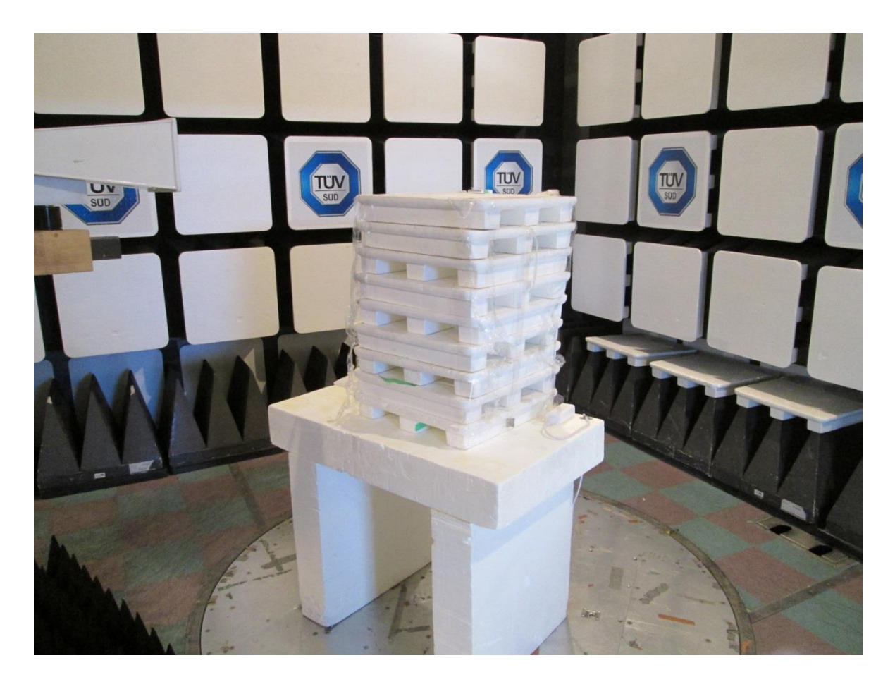
Test setup photo 5 Radiated measurements, 10 GHz – 18 GHz