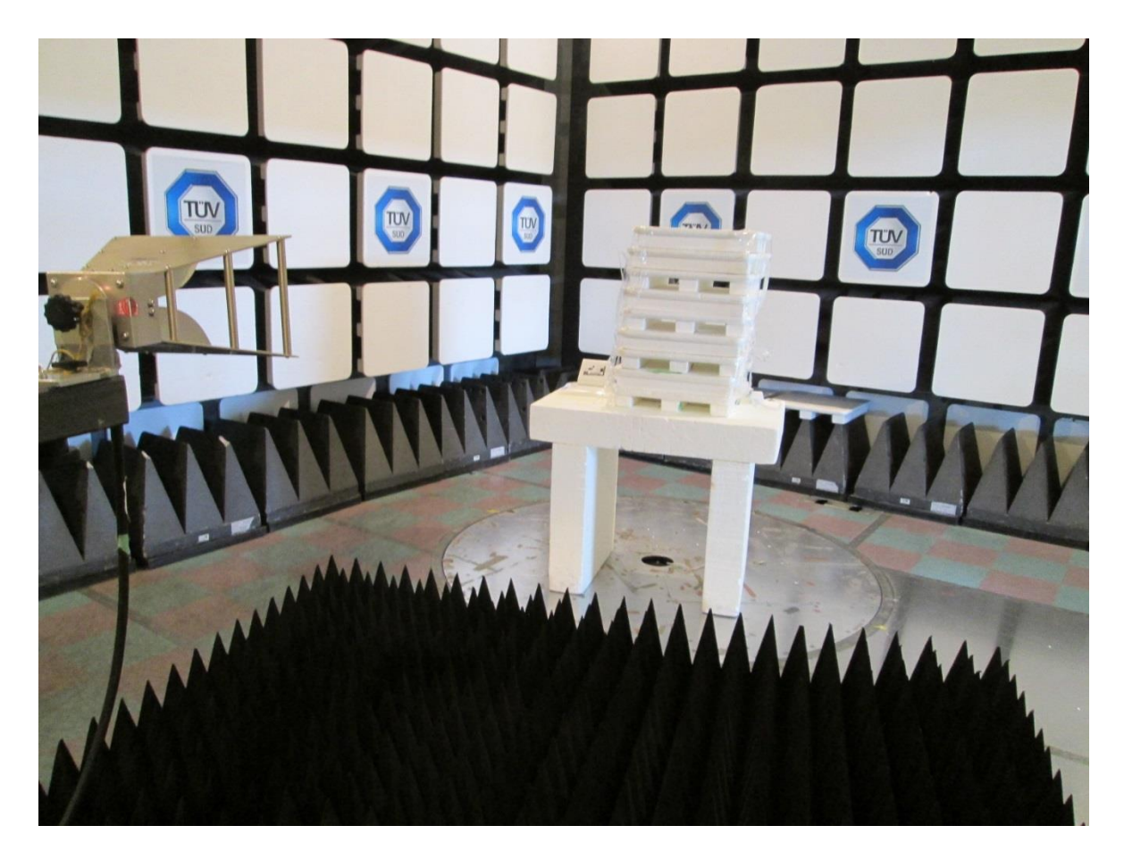
Test setup photo 3 Radiated measurements, 1 GHz – 2 GHz