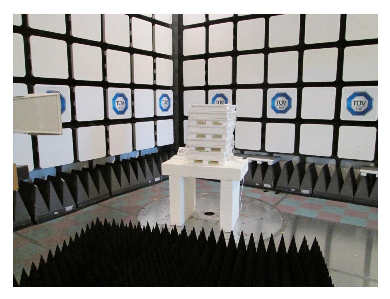
Test setup photo 4 Radiated measurements, 2 GHz – 10 GHz