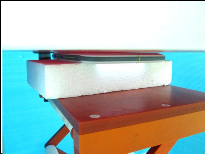
Rear Face of EUT with 0 cm Gap