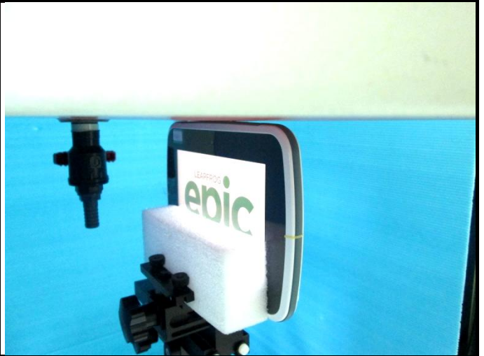
Top Side of EUT with 0 cm Gap