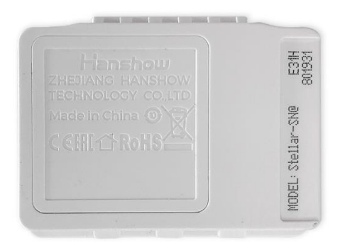
Figure 2-2 Rear panel of Stellar-S E31