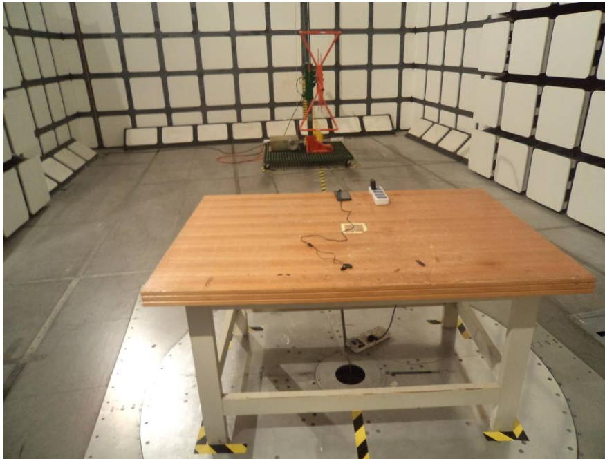
Radiated Emissions – Rear View (30-1000 MHz)