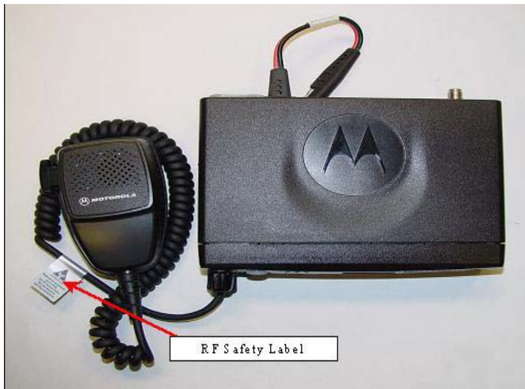
Figure 3-7: View of RF Safety Label attached to microphone cord