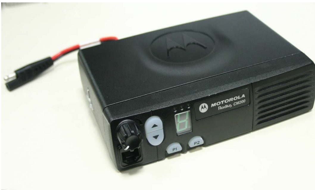
Figure 3-3: General View, CM200 Model