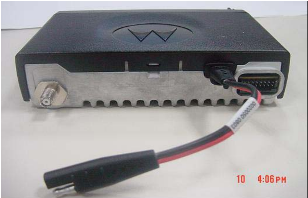
Figure 3-5: Rear view showing antenna connector, DC cable, and accessory connector