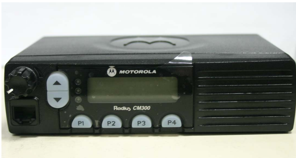
Figure 3-2: Front View, CM300 Model