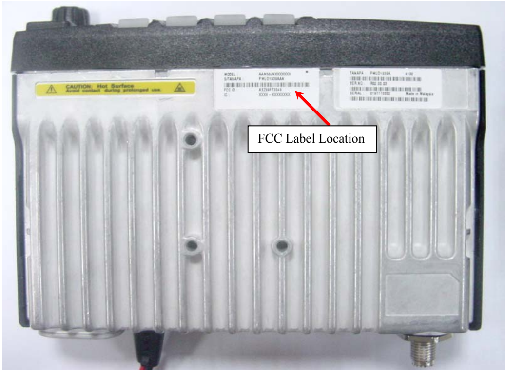
Figure 3-6: Bottom view showing location of FCC ID Label