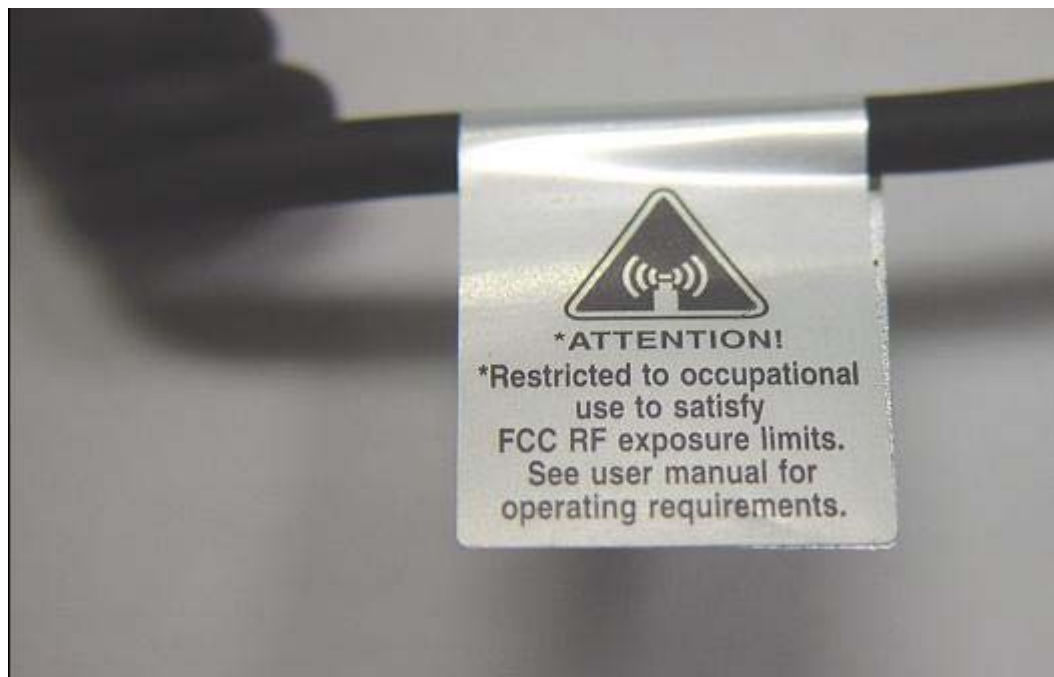
Figure 3-8: Close-Up of RF Safety Label