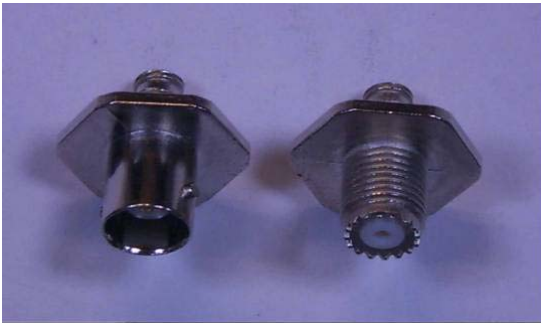
Figure 3-9: Antenna connector options: BNC (left), mini-UHF (right)