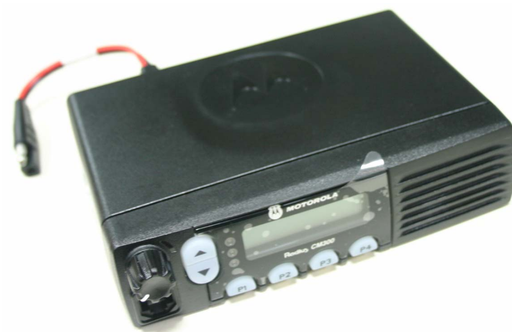
Figure 3-1: General View, CM300 Model