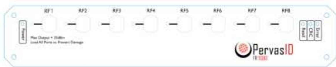
Figure 2: DAS RFID Antenna Ports and Status LEDs

Under normal operation, the LEDs of the active ports will flicker indicating activity on the ports and the read LED will flicker as tags are read while the reader is reading.