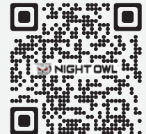
Option 2 Setup Video