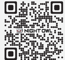
Option 1 Setup Video

NOTE: Doorbell is ONLY compatible with the WNIP2 Series Wi-Fi NVR.