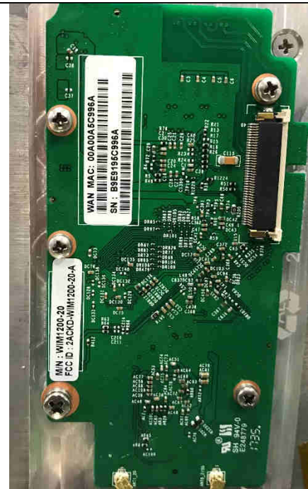
Access WiFi module in lid