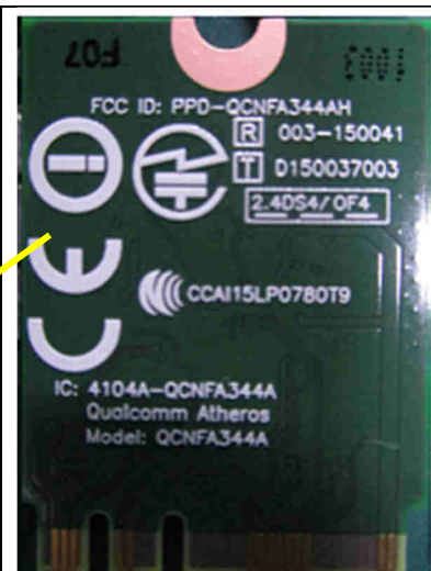
Underside of module