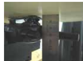
Figure 12. Body SAR