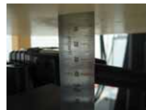
Figure 11. Mouth Face