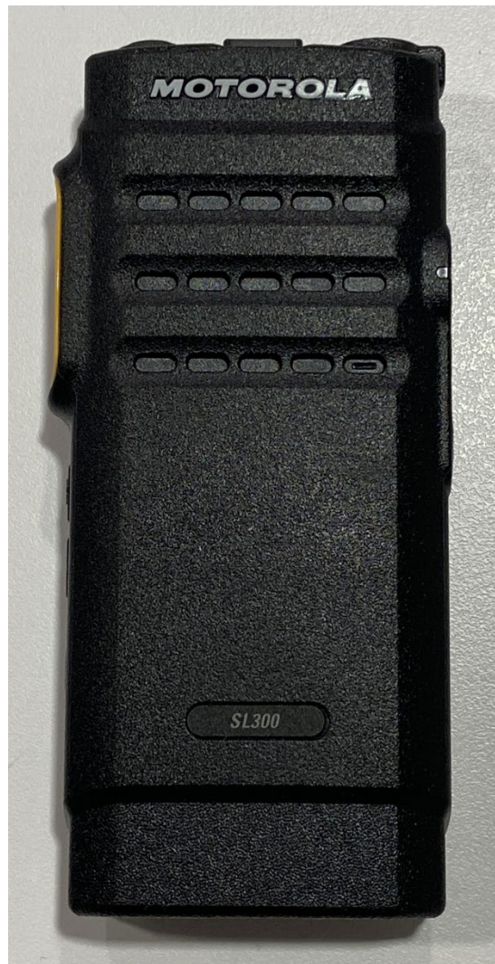
Front View with Battery & Battery Cover (SL300 - Display & Plain model)