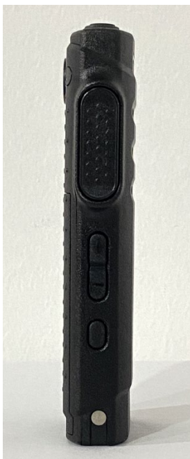
Side view (Right) with Battery & Battery Cover (SL300 - Plain model)