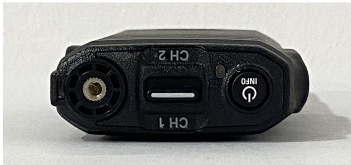
Top view with Battery & Battery Cover (SL300 - Plain model)