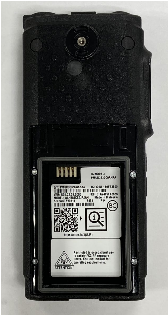
View of FCC/IC label location (SL300 - Plain model)