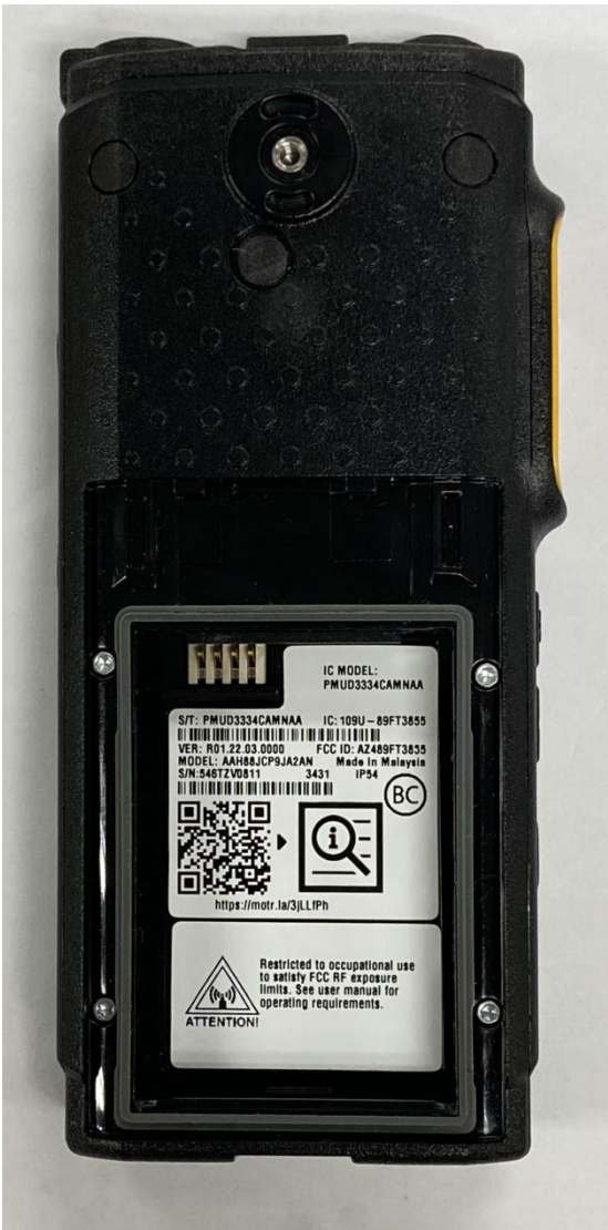
View of FCC/IC label location (SL300 - Display model)