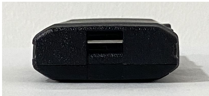
Bottom view with Battery & Battery Cover (SL300 - Display & Plain model)