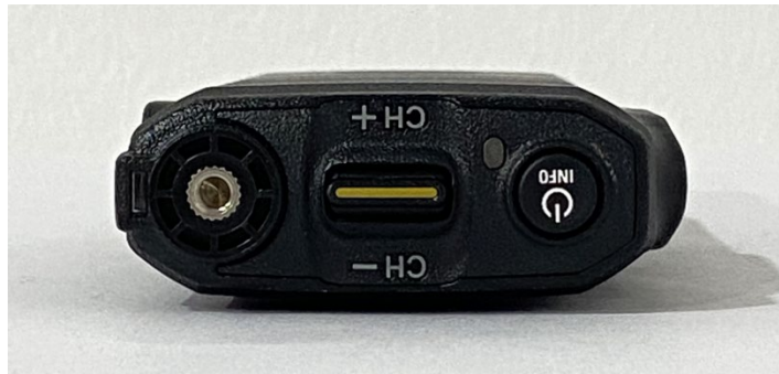
Top view with Battery & Battery Cover (SL300 - Display model)