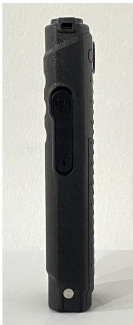
Side view (Left) with Battery & Battery Cover (SL300 - Display & Plain model)