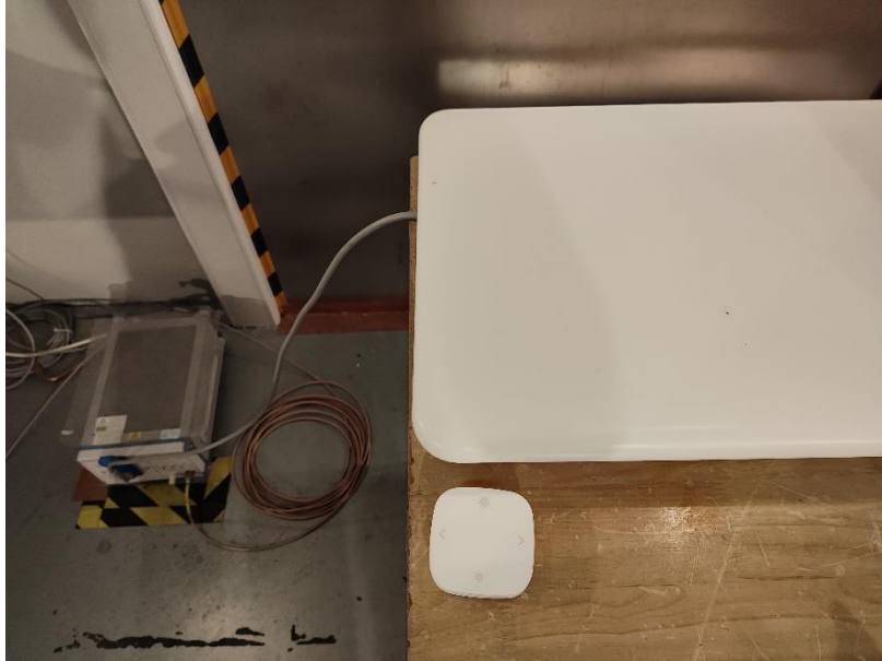
Photograph 2: Set-up for measurement of radiated emission, Below 1G